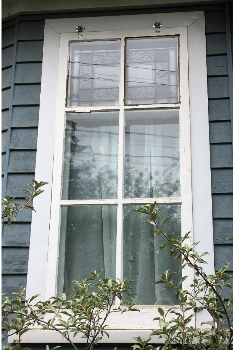
(Image 1.7: Typical one-over-one sash window profile, shown with original storm window, and painted trim)