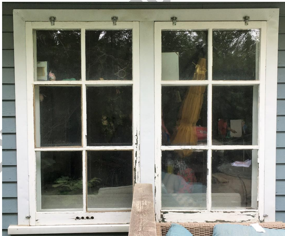
(Image 1.6: Typical one-over-one sash window profile, shown with original storm windows, and painted trim)