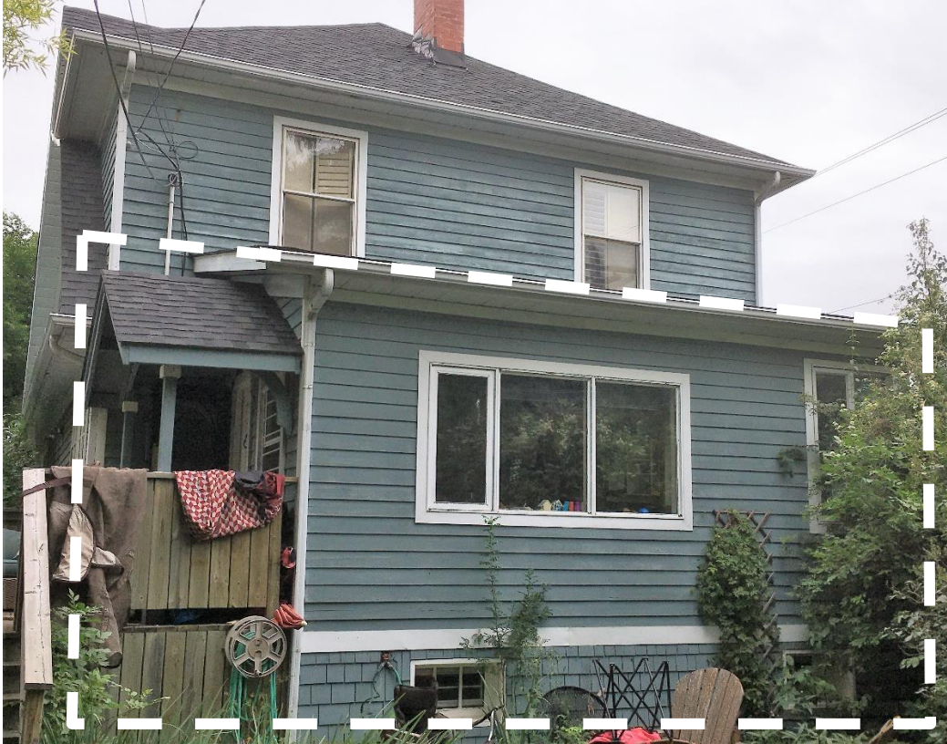
(Image 1.3: West façade. Non regulated addition is demarcated by white dashed line.)