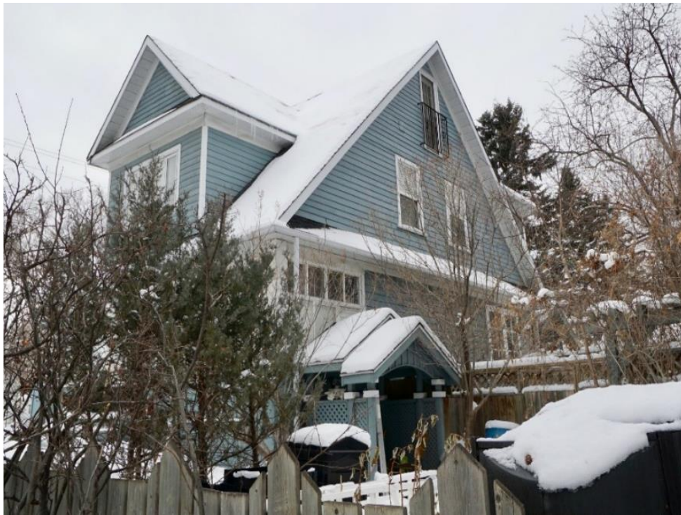
(Image 1.5: East façade fenestration. Note: uppermost window is not regulated.)