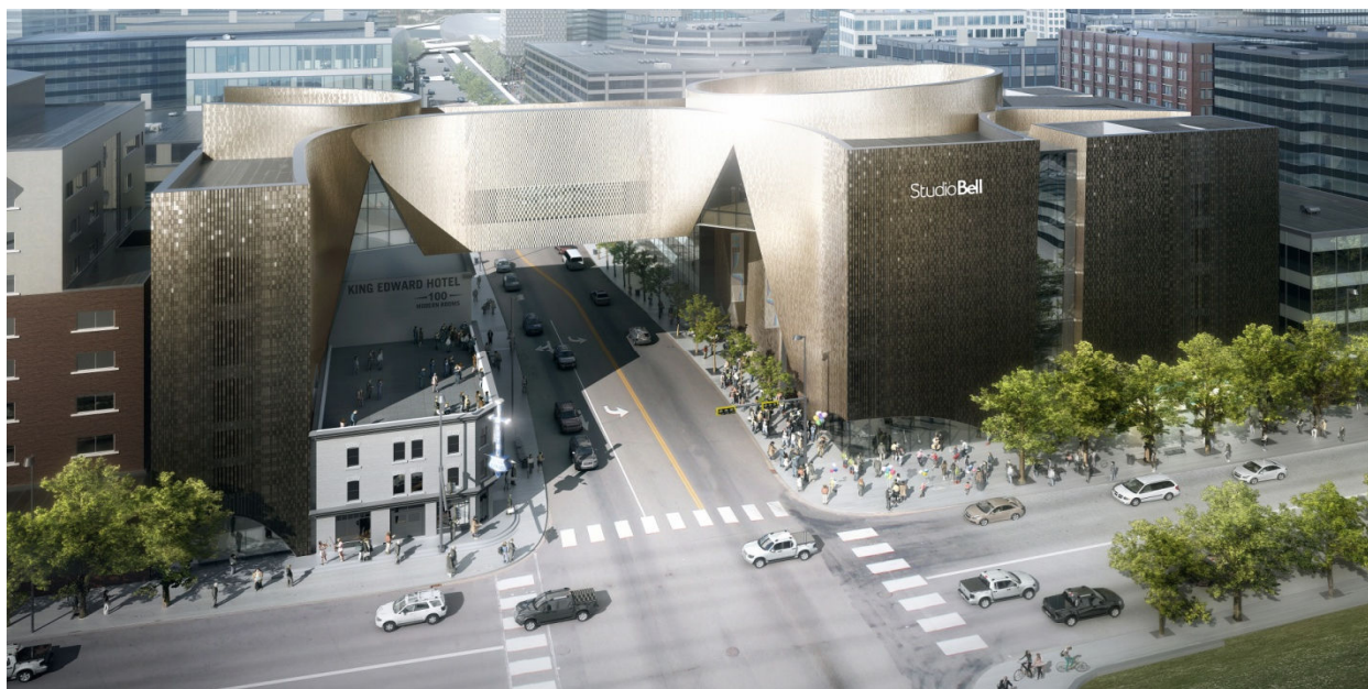
Studio Bell, Home of National Music Centre