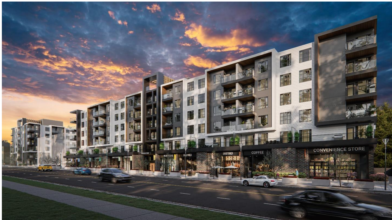
Figure 1 - Development Permit Rendering

The residential units are proposed as a mix of one and two-bedroom units. Customer parking for the retail units is located along the rear lane at grade and parking for the residents is provided in two levels of underground parking. A total of 99 parking stalls are required as per Land Use Bylaw 1P2007 and 146 parking stalls are provided.