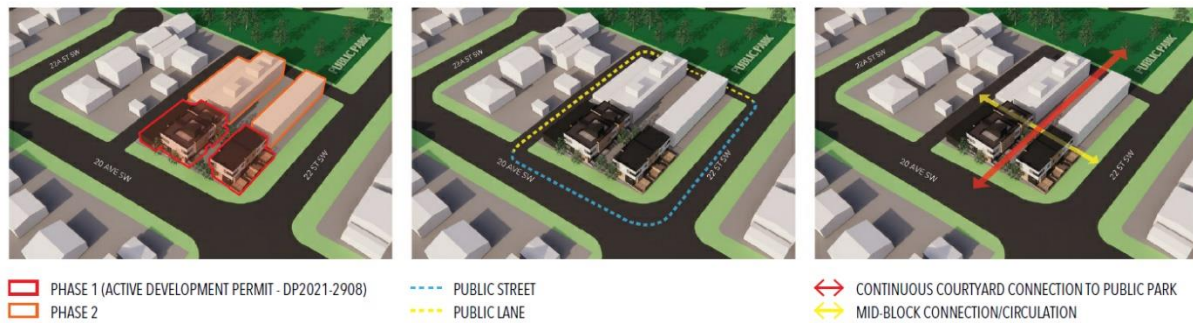
Figure 1: Conceptual Scheme (note phase 2 may be subject to change)

The following excerpts (Figure 2 and 3) from the development permit application provide an overview of the proposal and are intended for information purposes only. Administration's review of the development permit application will determine if the proposed change of use is appropriate for the subject site. No decision will be made on the development permit application until Council has made a decision on this land use amendment application.