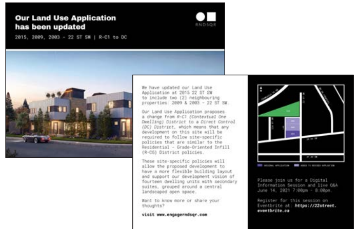
DELIVERED: MAY 28, 2021