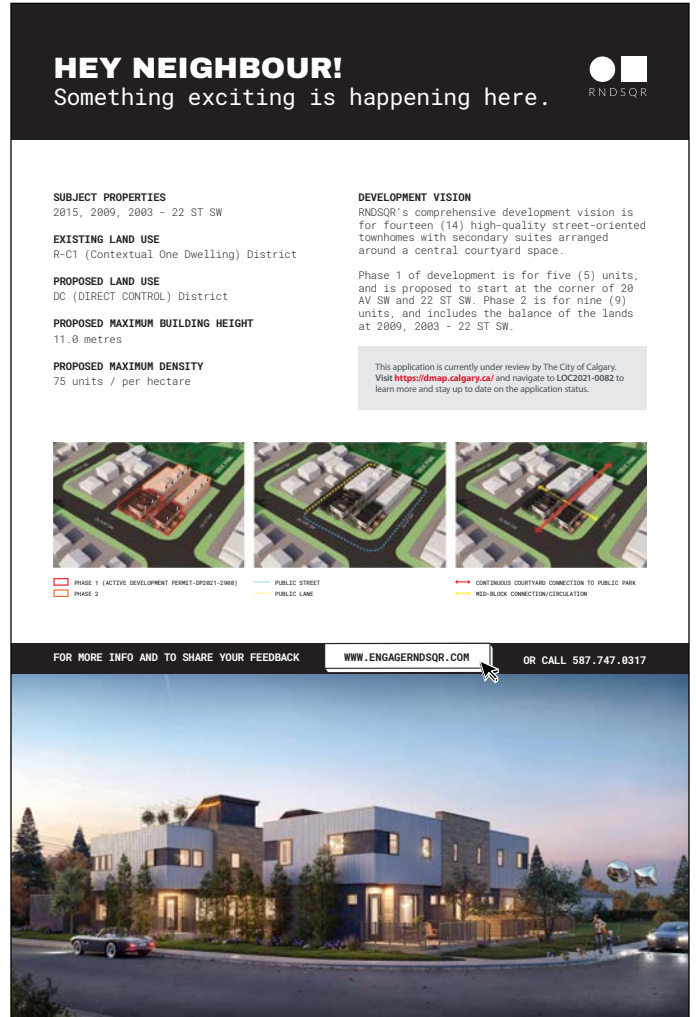
INSTALLED: MAY 28, 2021 | SIZE: 40" X 60"