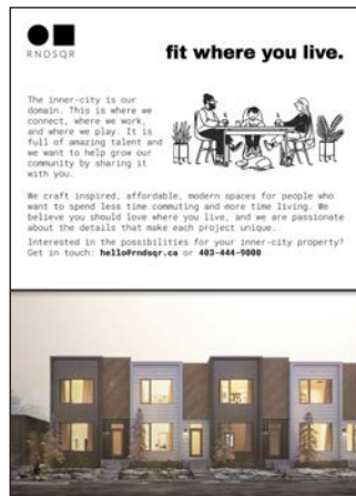
DELIVERED: NOVEMBER 13, 2020