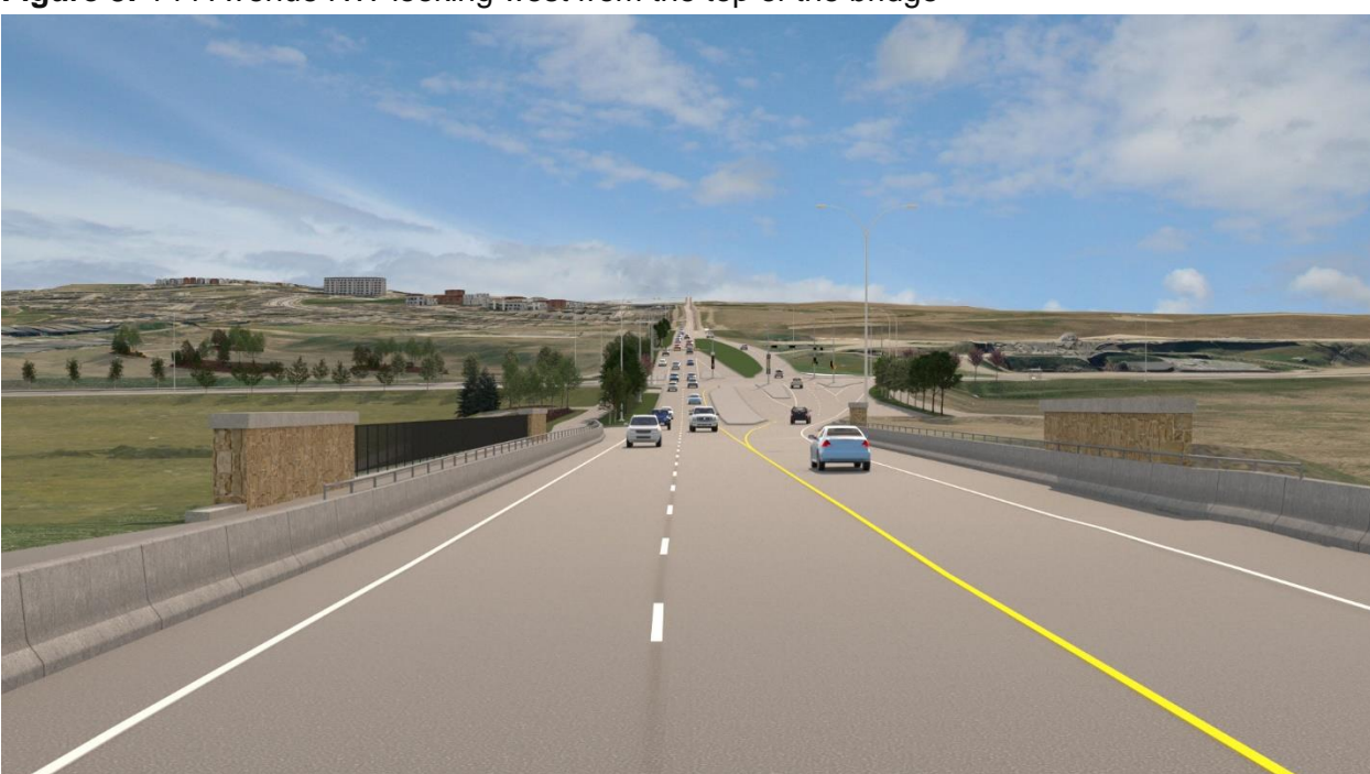
Figure 3: 144 Avenue NW looking west from the top of the bridge