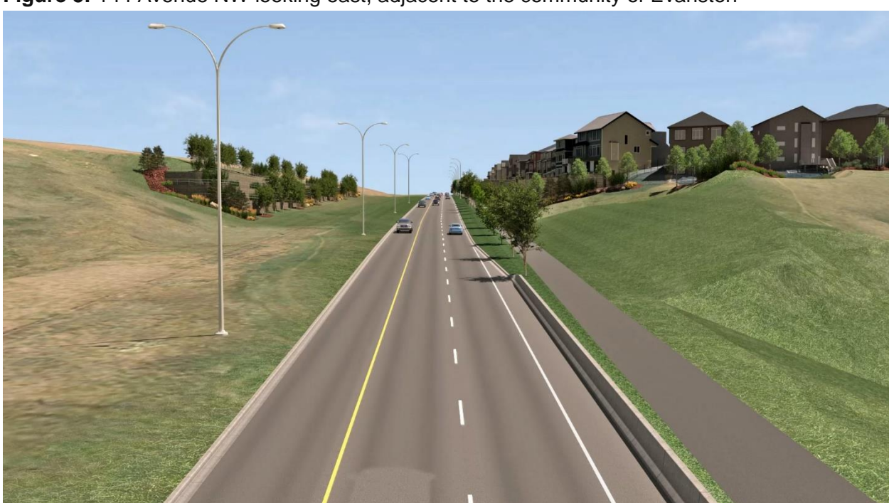
Figure 5: 144 Avenue NW looking east, adjacent to the community of Evanston