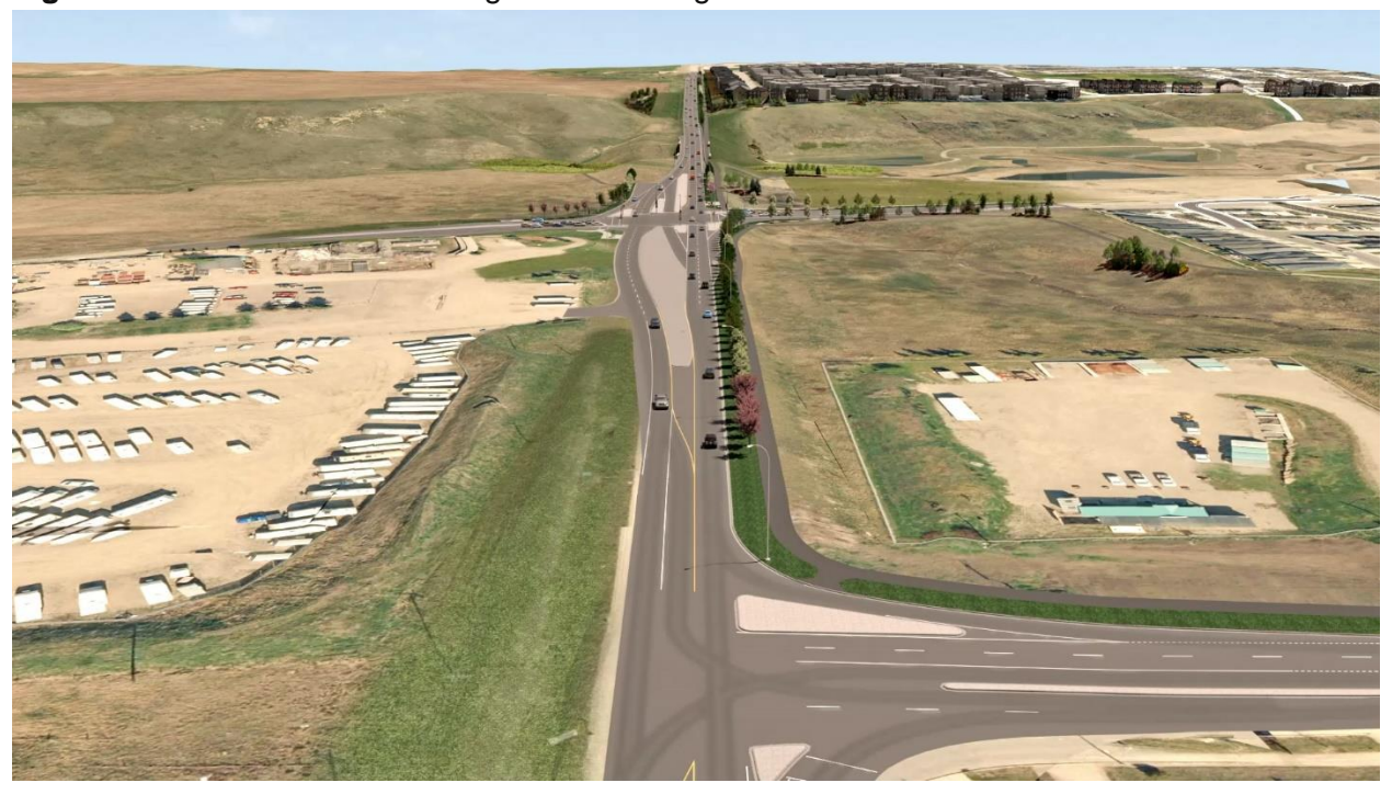
Figure 2: 144 Avenue NW and Symons Valley Road NW intersection looking east towards the community of Evanston