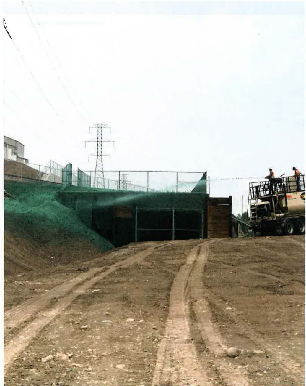
Fisheries and aquatic survey work in the vicinity of Prince's Island and the Bow River.