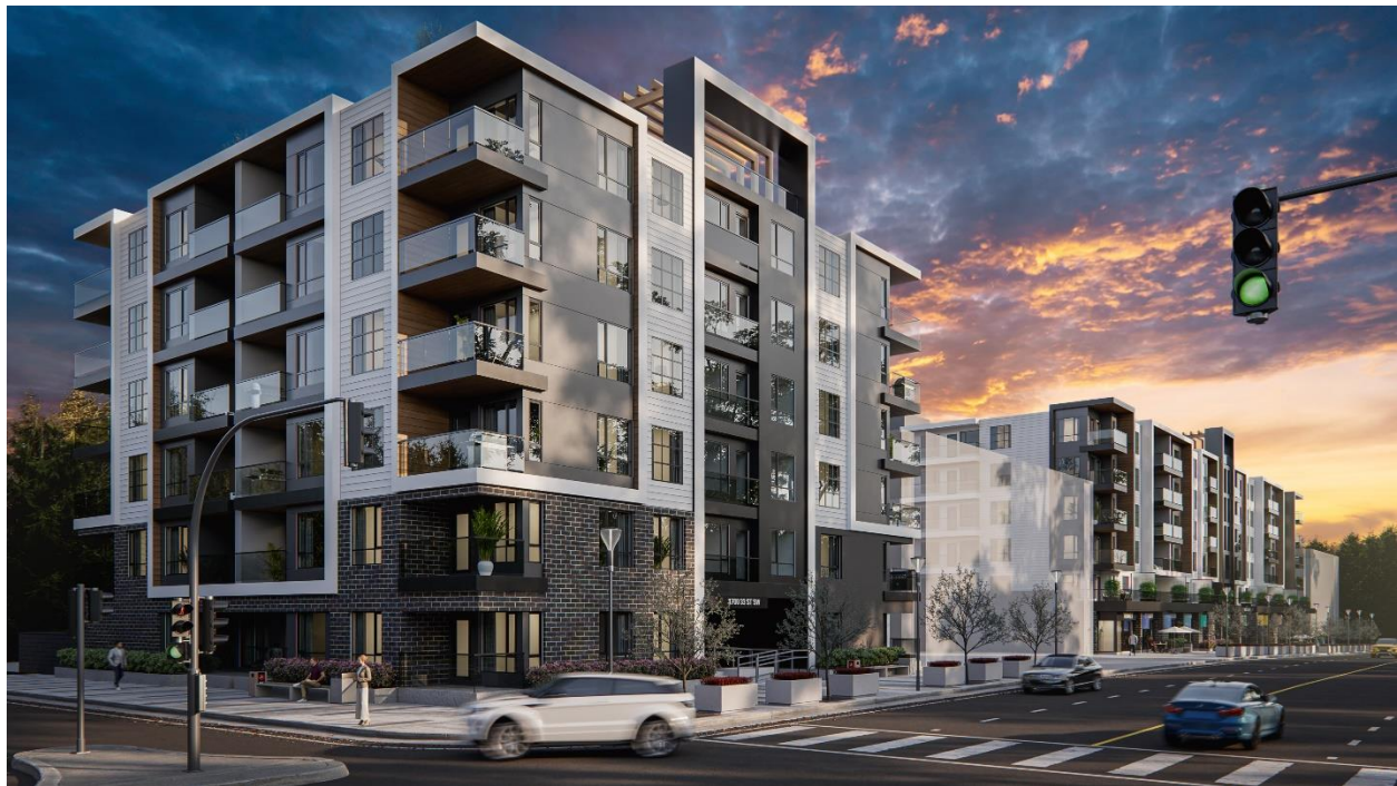
Figure 1 - Development Permit Rendering

The residential units are proposed as a mix of one and two-bedroom units. Parking for the residents is provided in three levels of underground parking. A total of 42 parking stalls are required as per Land Use Bylaw 1P2007 and 53 parking stalls are provided.