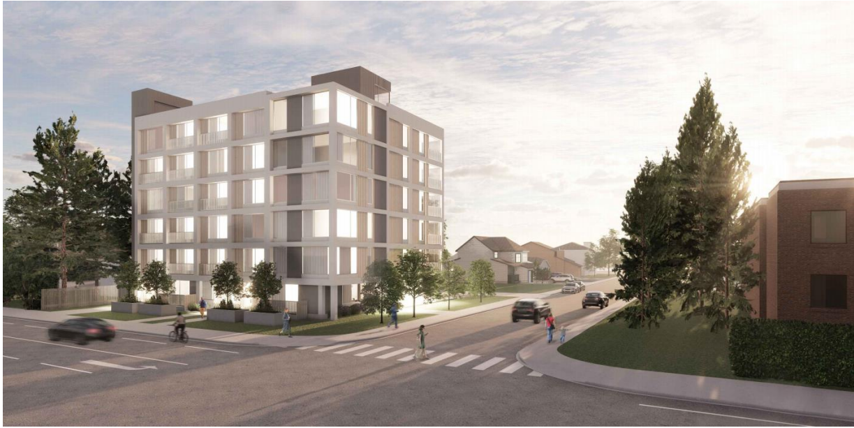
Figure 2: Streetview Rendering