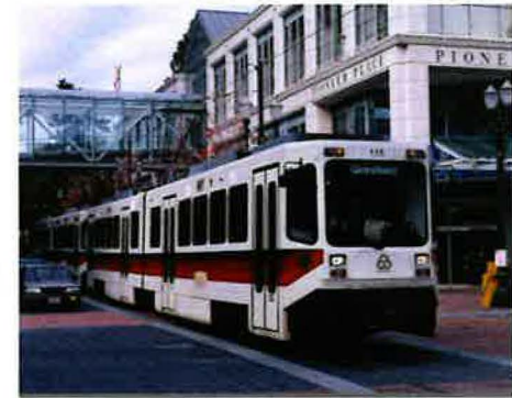
Marketing + promotion