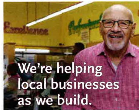
Business capacity building