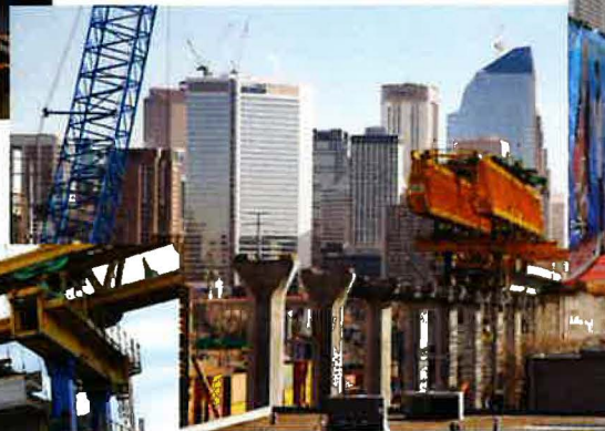
West LRT, Calgary