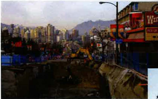
Canada Line, Vancouver

Why is this important? Construction will be disruptive for Calgarians, for businesses and for communities along the Green Line alignment.