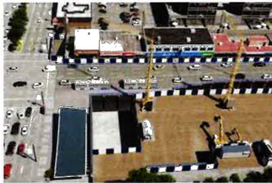
Access + construction management