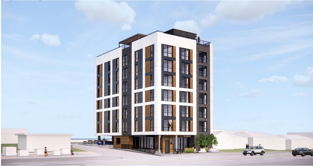
Figure 1 Proposed Overall development

The following renderings (Figure 1& Figure 2) and site plan (Figure 3) are from the application submission and provide an overview of what is being proposed. These renderings are included for informational purposes only.