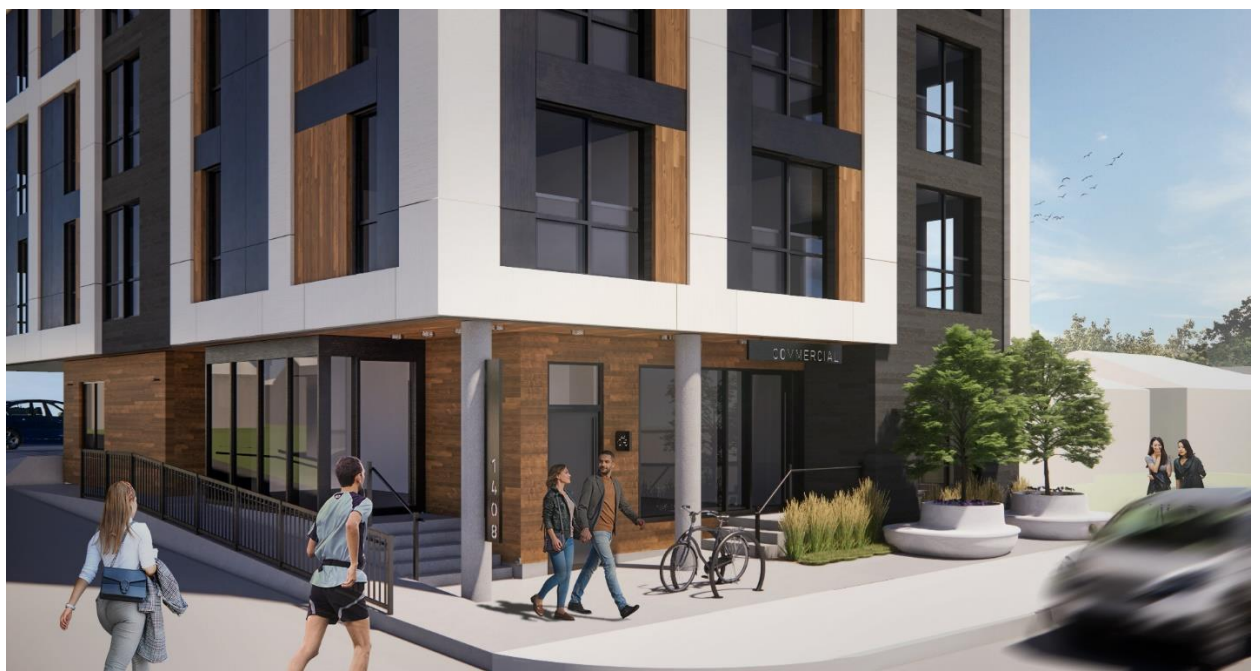
Figure 2 Proposed Street-level view, from 33 Avenue SW