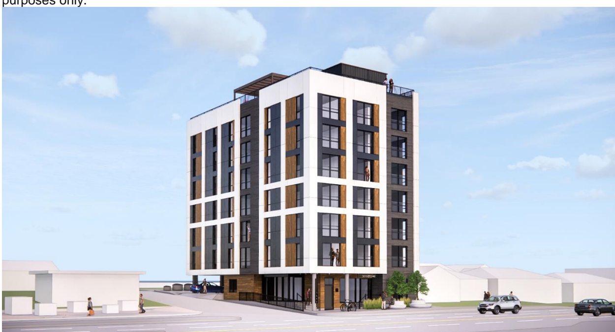
Figure 1 Proposed Overall development

The following renderings (Figure 1& Figure 2) and site plan (Figure 3) are from the application submission and provide an overview of what is being proposed. These renderings are included for informational purposes only.