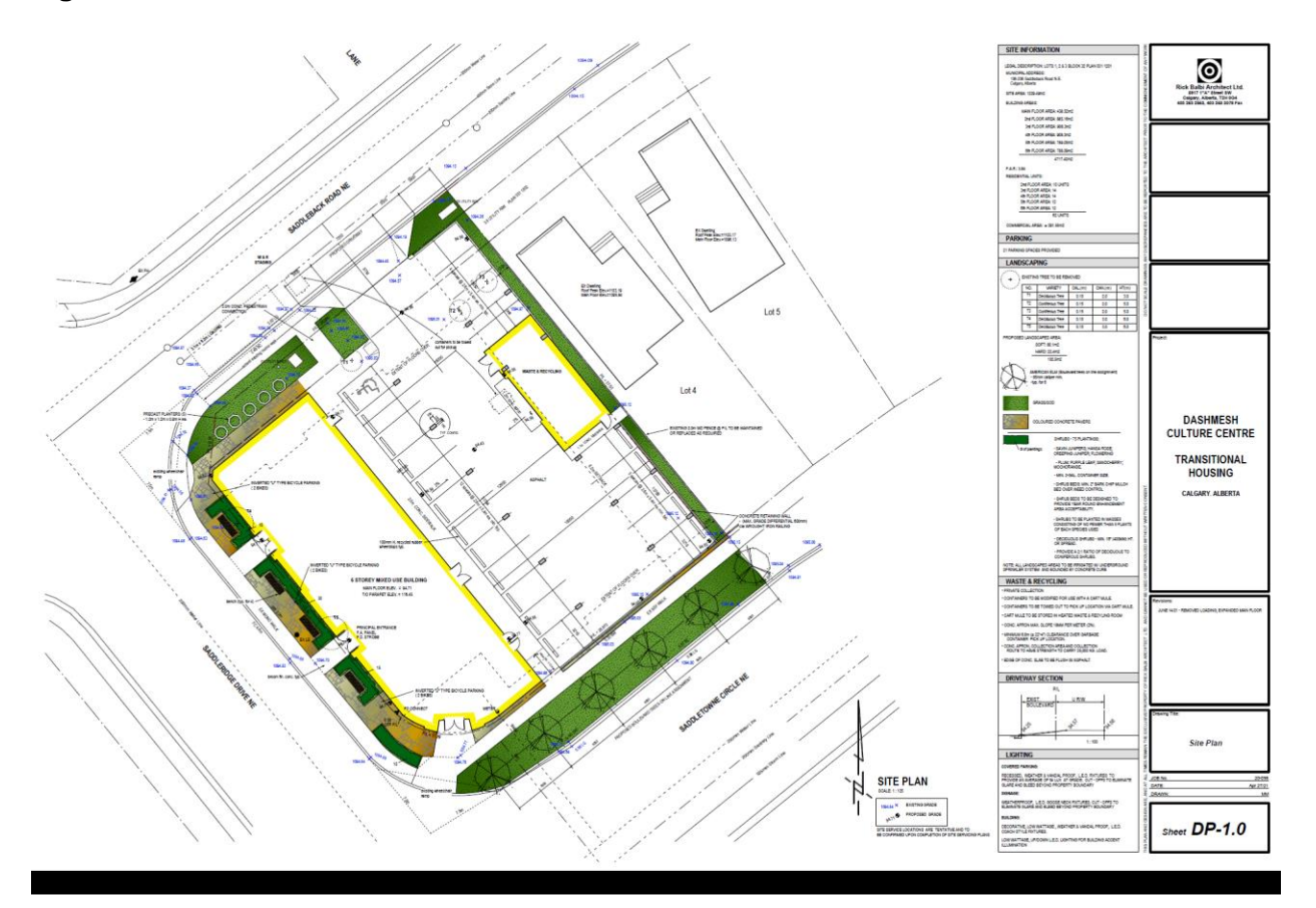
Figure 3: Site Plan