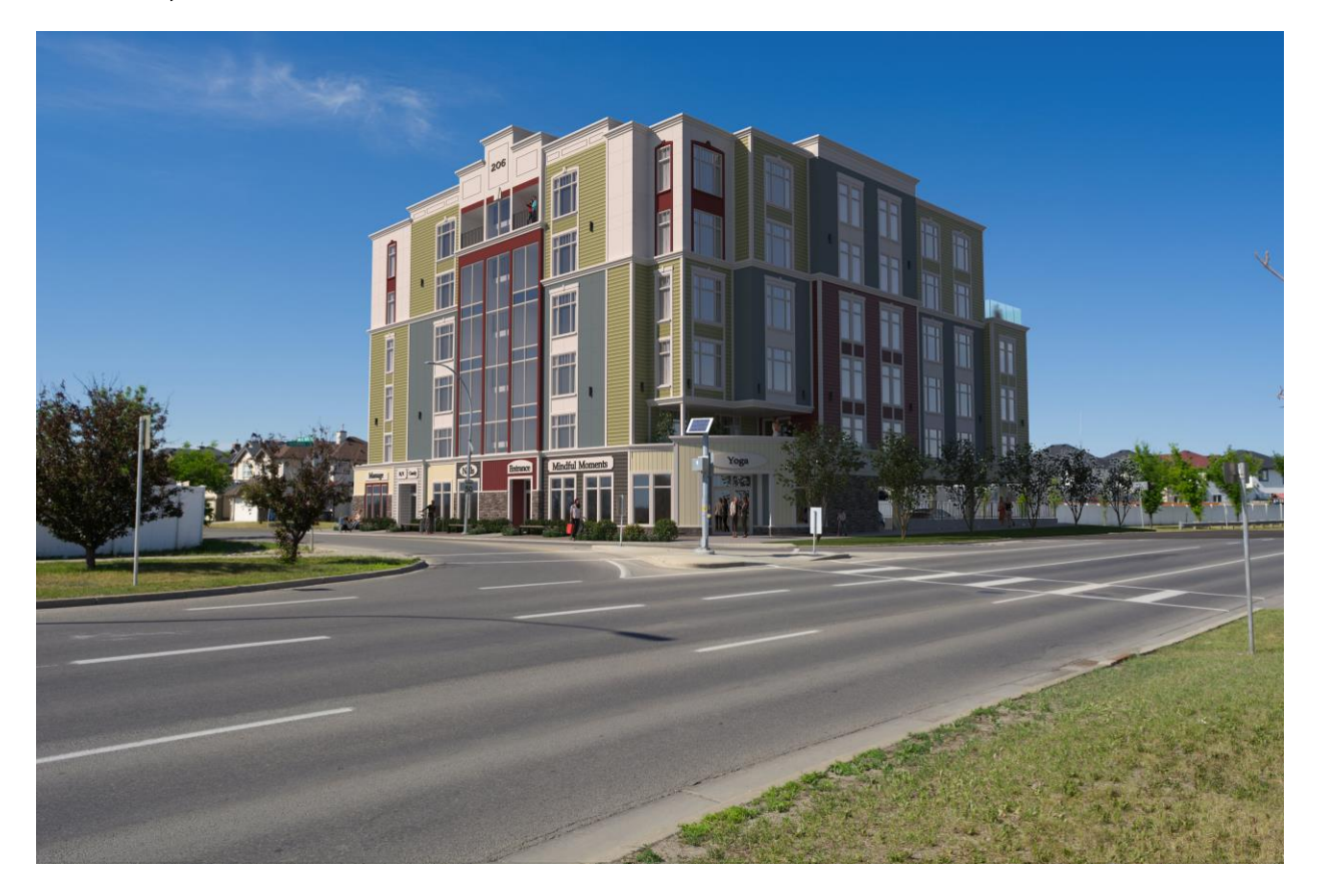
Figure 2 : Rendering of Proposed Development (View looking northwest from Saddletowne Circle NE)