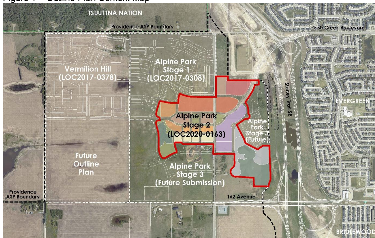
Figure 1 – Outline Plan Context Map

The subject lands are adjacent to two recently approved outline plan and land use amendment applications, both of which are for neighbourhoods that form the community of Alpine Park. Directly to the north of the subject site is Dream's first stage of Alpine Park (LOC2017-0308). To the northwest of the subject site is Qualico's approved outline plan and land use application (LOC2017-0378) for Vermillion Hill. Figure 1, as shown below, outlines the location of the subject lands in relation to the other developments in Alpine Park. Limited development has now begun to the north of the subject lands and the first homes are anticipated to be completed later this year.