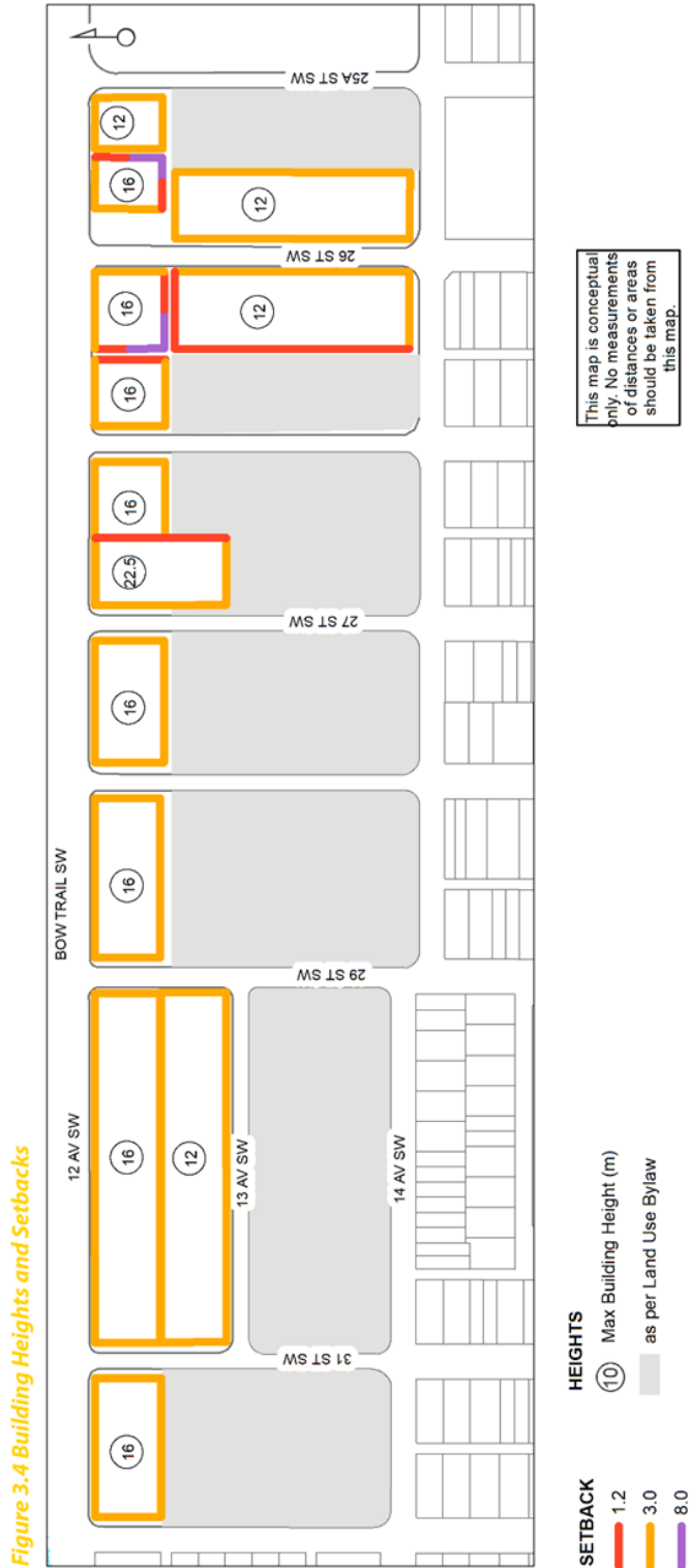
Revised Figure 3.4 Building Heights and Setbacks