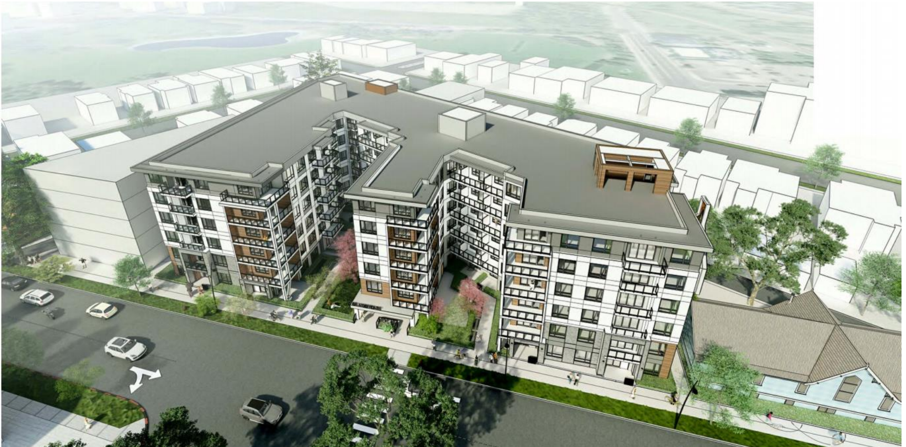
Figure 2: Rendering from Gladstone Road NW