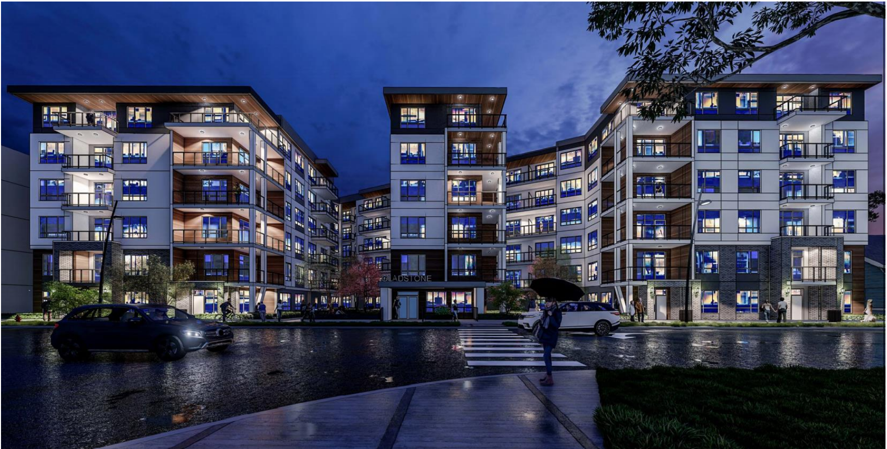
Figure 3: Rendering from Gladstone Road NW