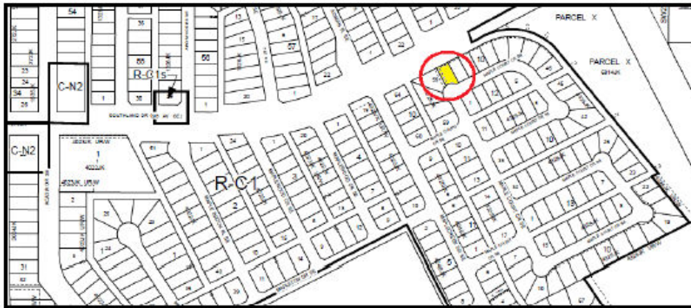
Map of 20 Maple Court Crescent SE, Calgary AB.