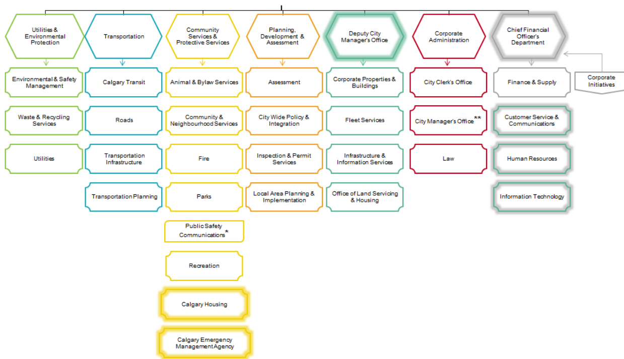
Figure 1: Departmental organization in the 2015 Mid-Year Accountability Report

With respect to this strategic alignment, as at 2016 June 30, all budget transfers have yielded a net-zero impact at the corporate level. Impacts to budgets are contained in the report titled, 2016 Capital Budget Recast and Other Capital Revisions (PFC2016-0713).