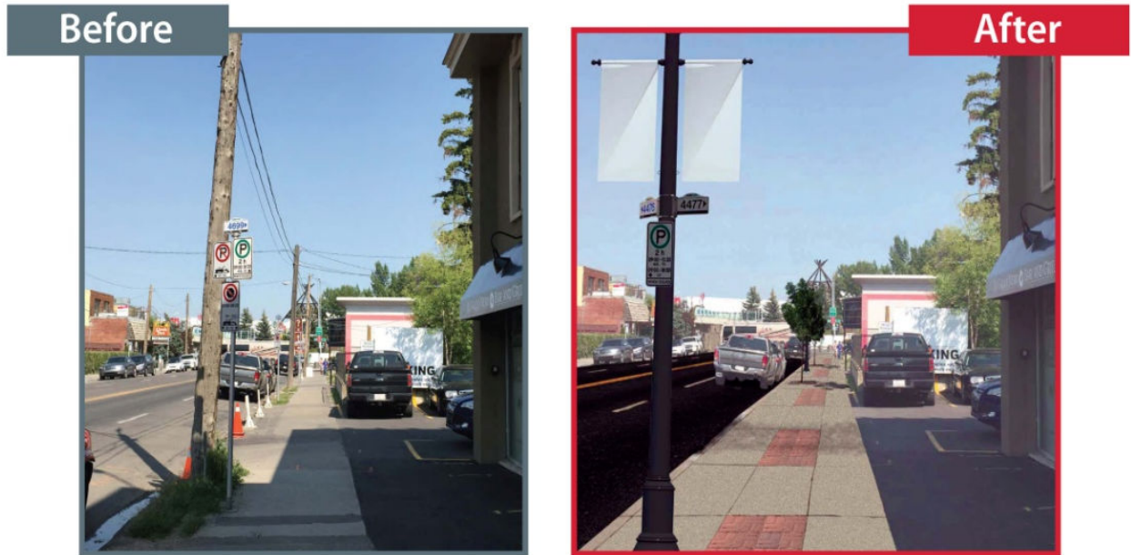
Improvements to this area include new sidewalks, lighting, trees, burying the utilities and removing the utility poles.