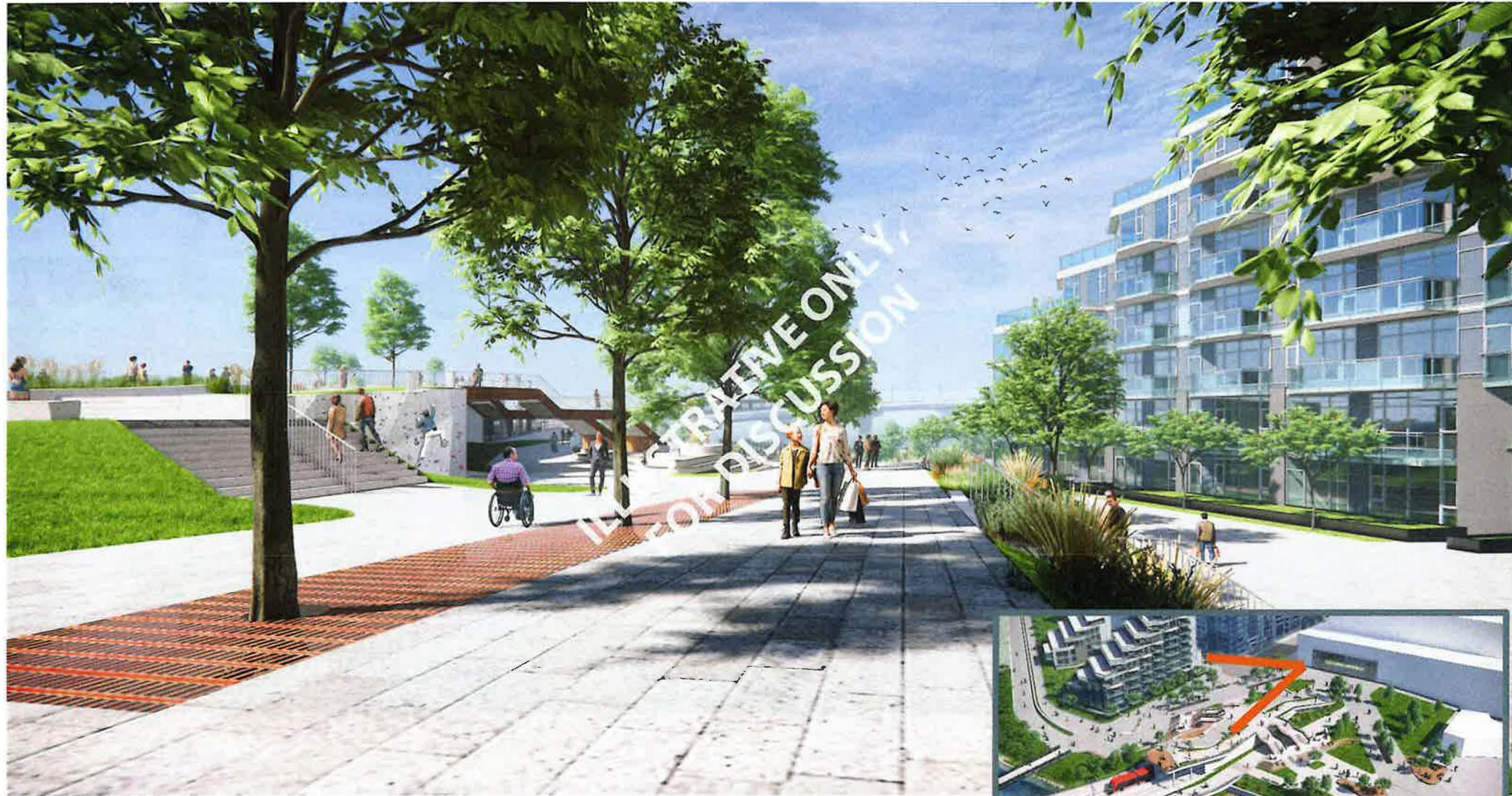
View from 2 Street to north