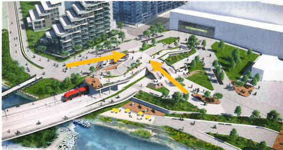
Pathway 'up and over' portal