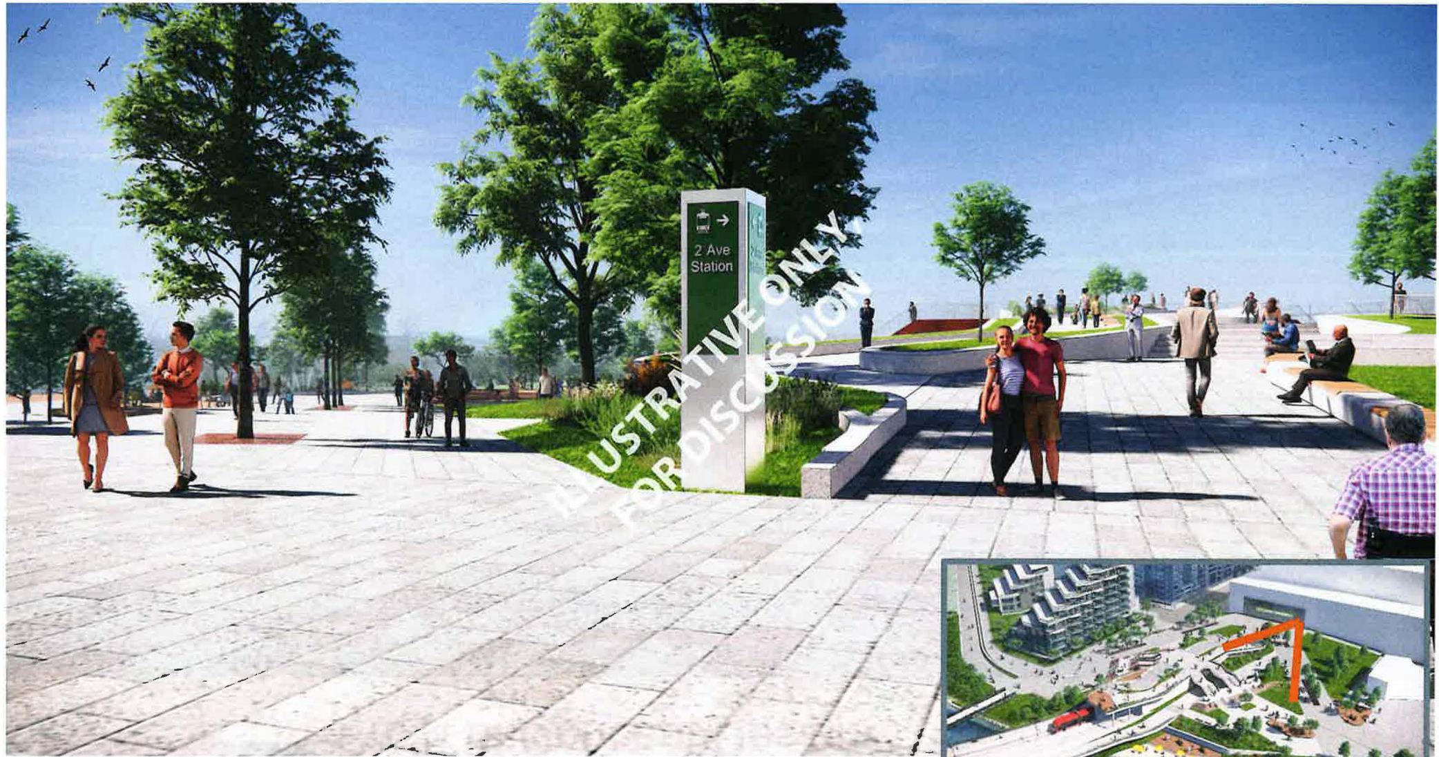
View from 2 Avenue Station Entrance – Facing NW