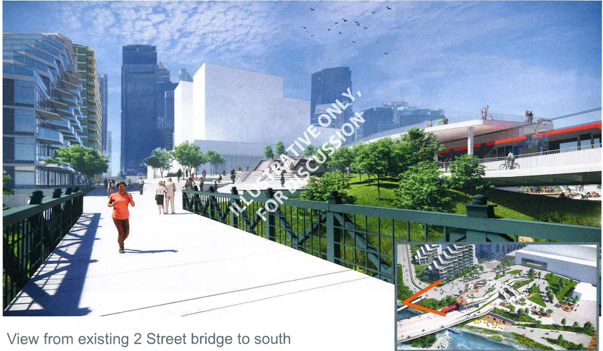
View from existing 2 Street bridge to south