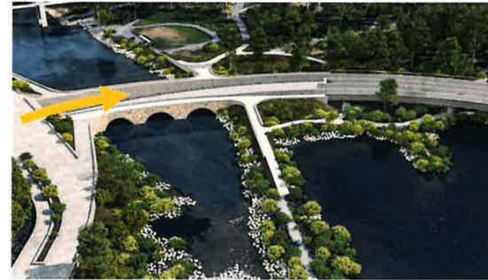
Shift portal north into island