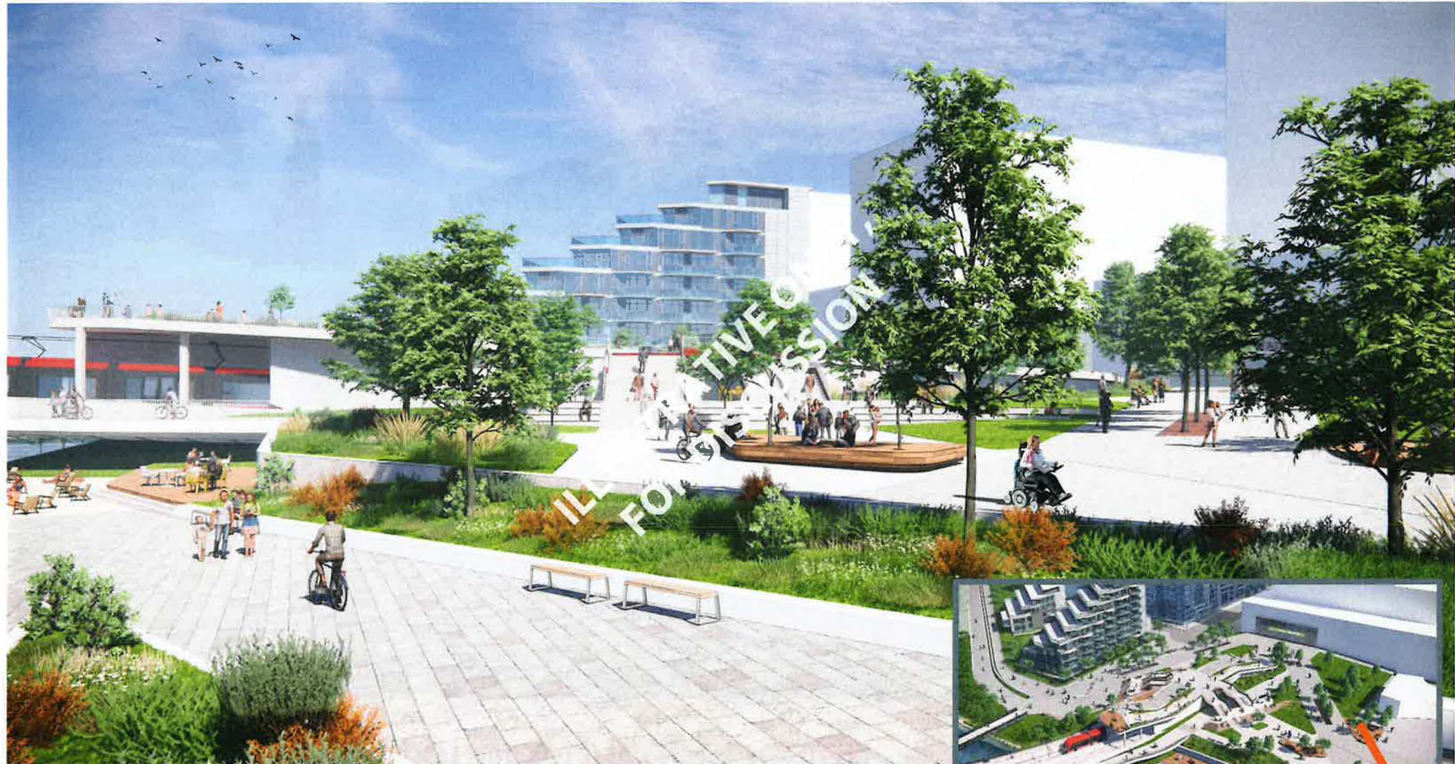
View from Lagoon Beach to East