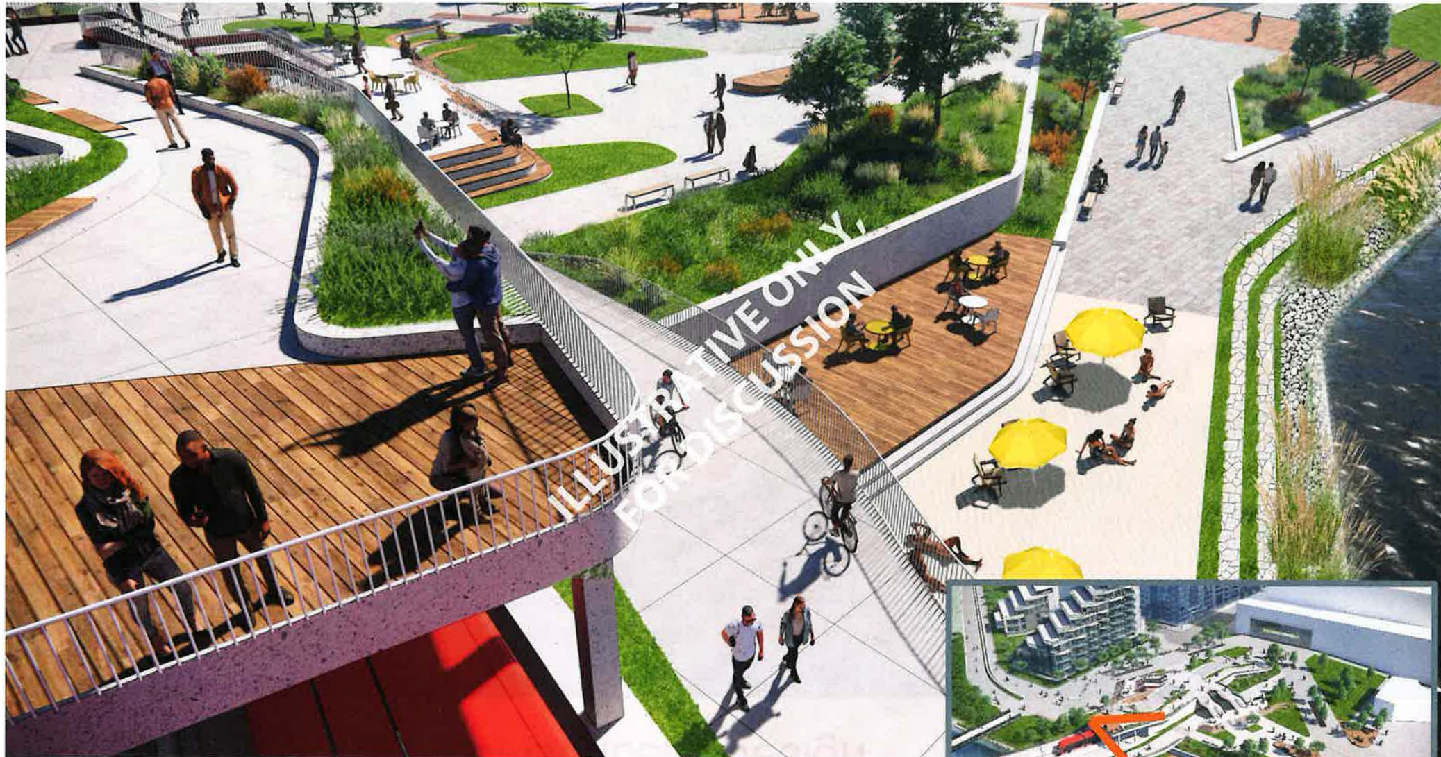
Low oblique view of overlook, bridge pathway, promenade, beach