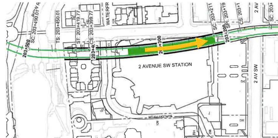
Shift 2 Avenue Station south