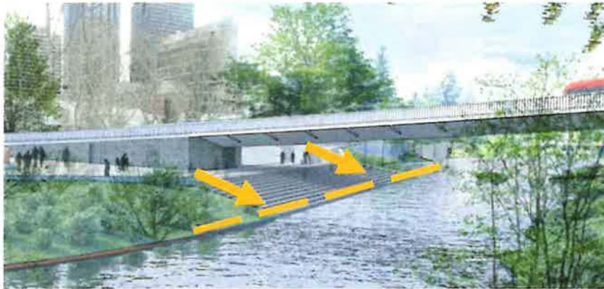
Lower pathway elevation