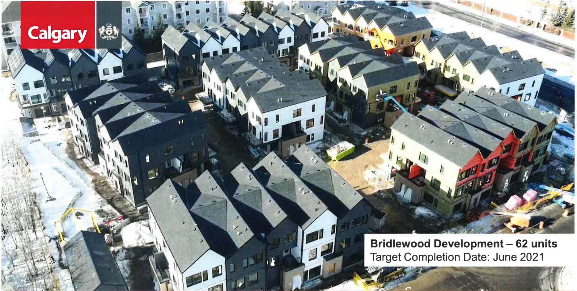
Bridlewood Development – 62 units Target Completion Date: June 2021