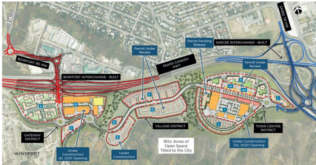
Figure 1: Existing Blocks within Medicine Hill and Status of Development

H has 158 apartment rental units and 24,542 square feet of commercial space to be developed, Block I has 158 apartment rental units and 189,204 square feet of commercial developed as well as a senior’s mixed-use apartment development with 275 rental units and 5,834 square feet of commercial space under construction (see Figure 1 below).