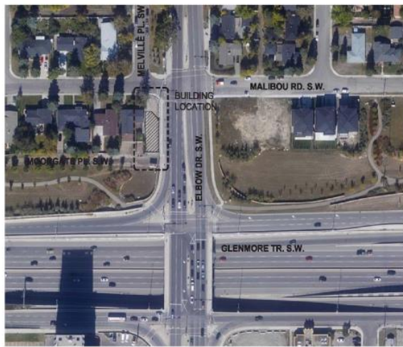
1 A0 LOCATION PLAN SCALE 1:50