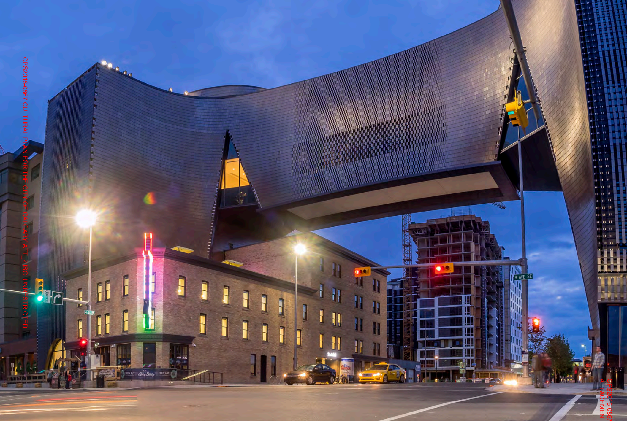
Studio Bell, Home of the National Music Centre

It's time to seize our cultural momentum, to fully commit to a culturally dynamic city.