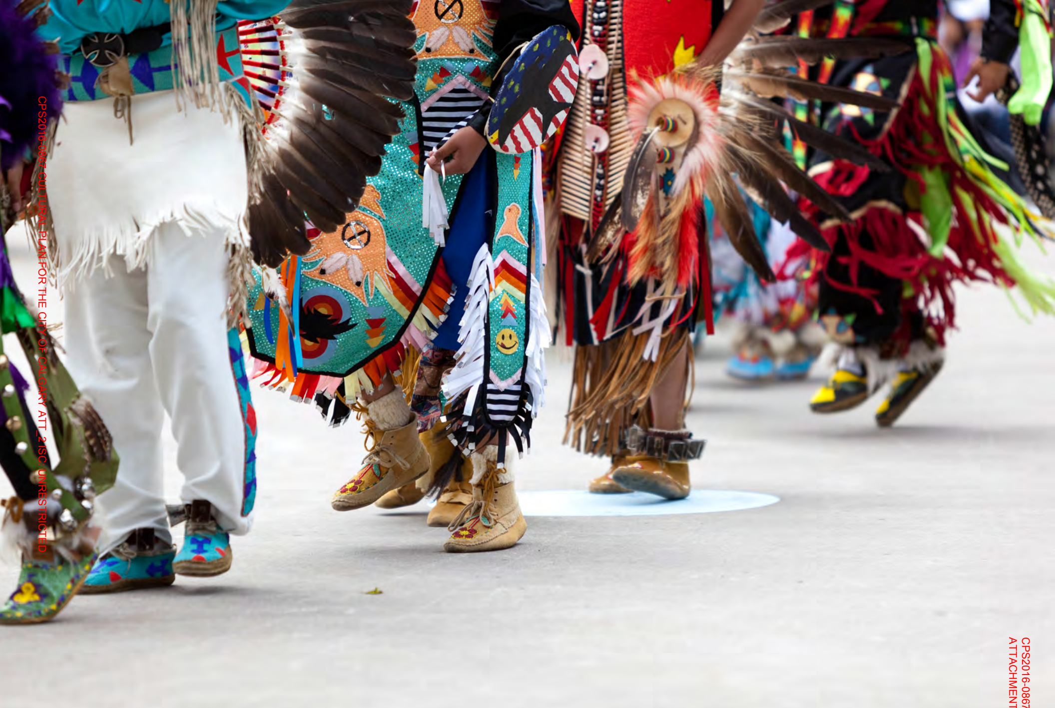
First Nations Parade at Calgary Stampede Rope Square

Calgary joins a group of leading cities in recognizing the role of culture as a central force in shaping the growth of more livable cities.