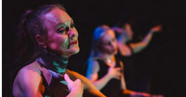
Calgary I Love You, But You're Killing Me by One Yellow Rabbit