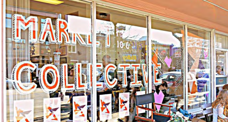
Market Collective early days