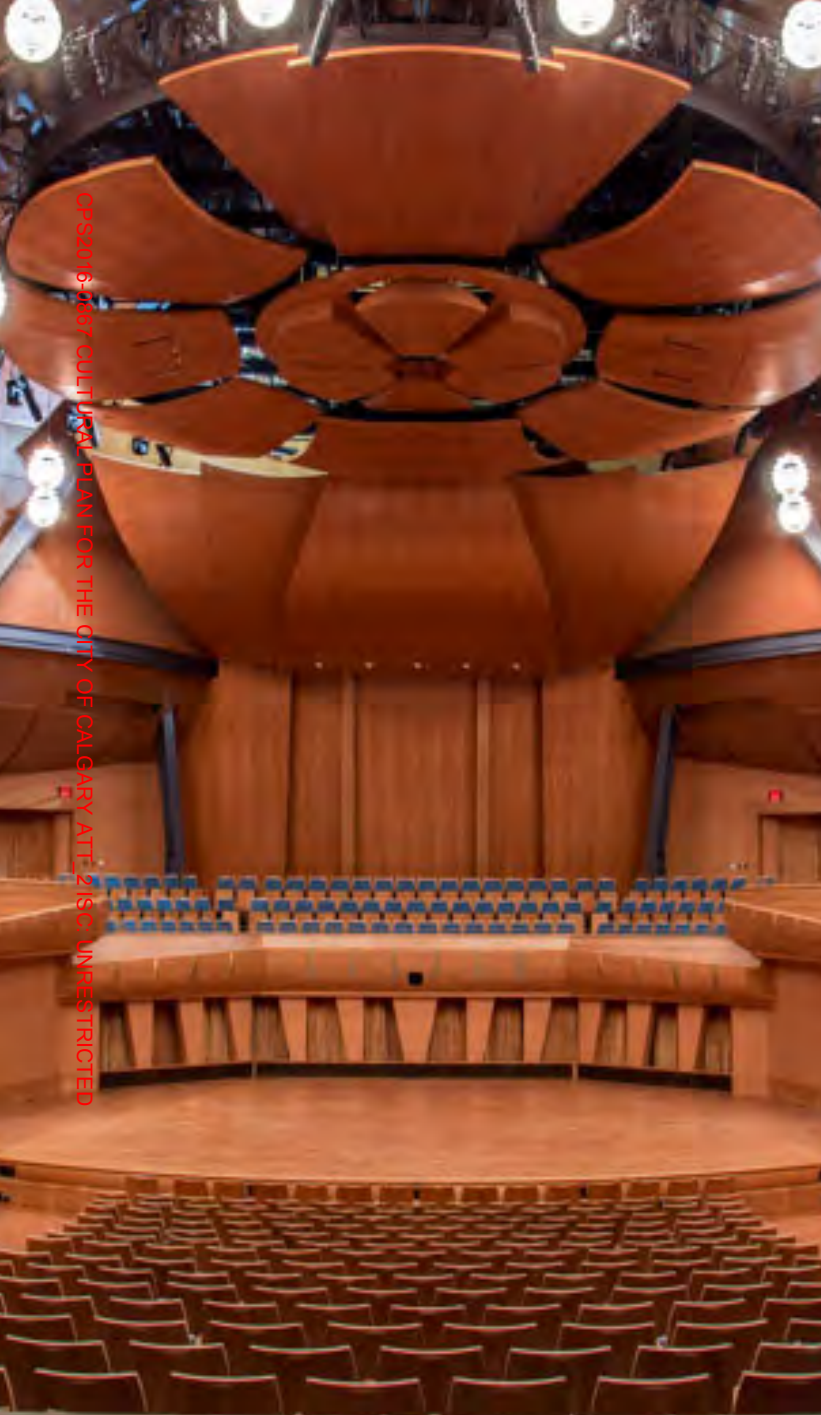
Taylor Centre for the Performing Arts, Mount Royal University