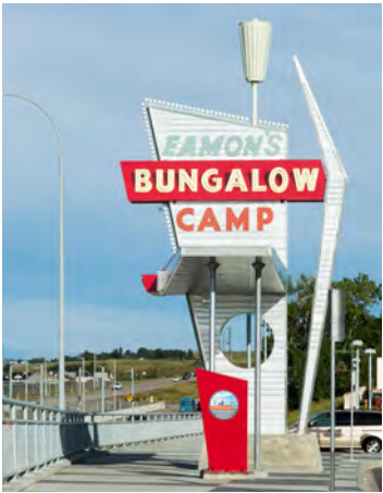
1950s Eamon's Bungalow Camp sign at Tuscany LRT station

Following are the Strategic Priorities and their visions for 2026, followed by Actions for each priority through the next City of Calgary business cycle.