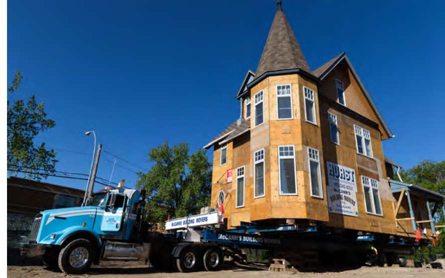
Moving the historic McHugh house