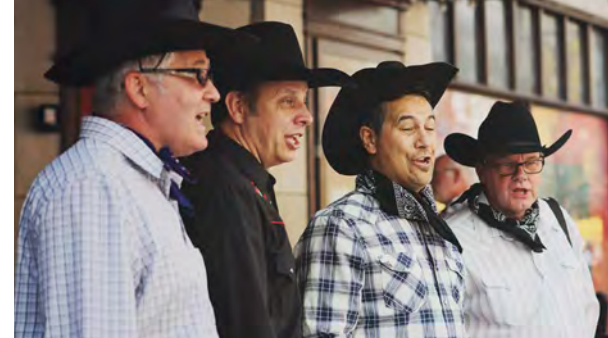
Barbershop quartet during Calgary Stampede