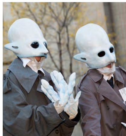
Green Fools Theatre at Culture Days