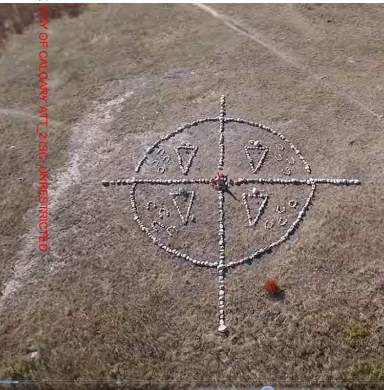
Medicine wheel at Nose Hill Park