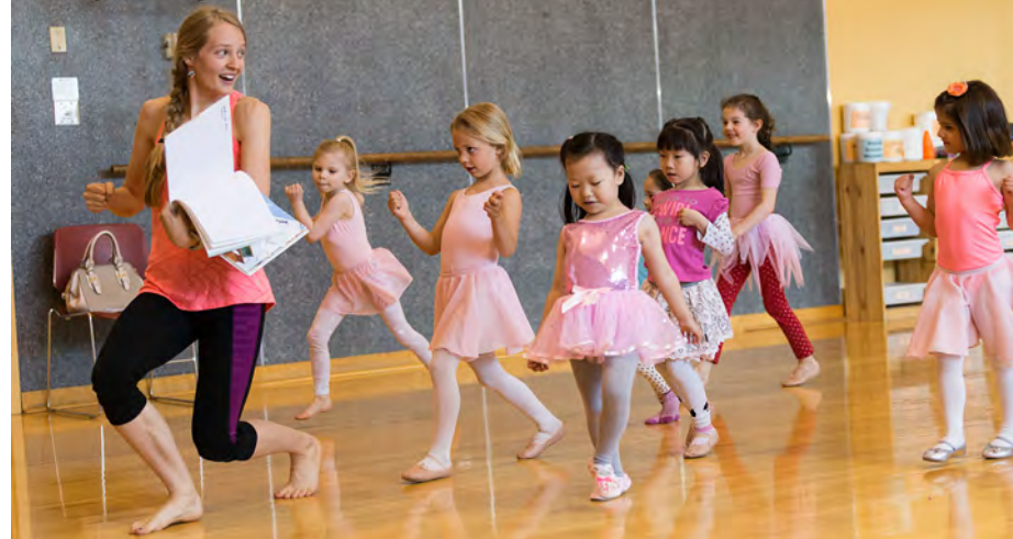
Dance class at Wildflower Arts Centre