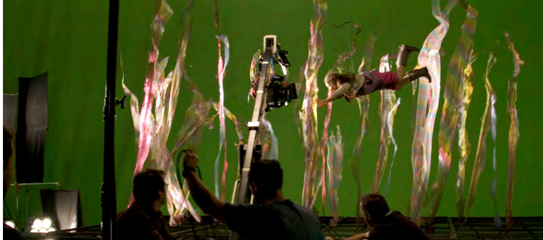
Stop motion for Tideland movie from Bleeding Art Industries