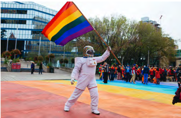
Pride Parade has landed