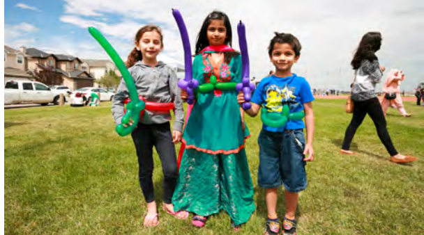
Sherwood BBQ and Multicultural Festival