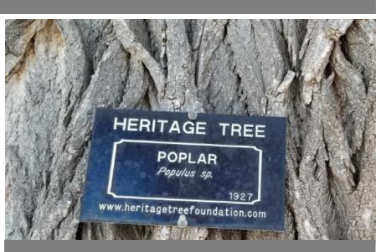
Heritage tree located on 15<sup>th</sup> Ave. in front of two character homes. Increased building scale at this location will put development pressure on these community assets.