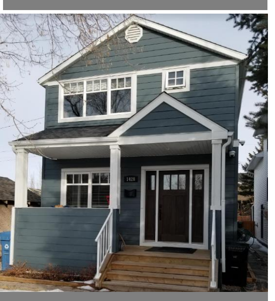
1428 1A ST NW, renovated c.1913 2-story home, immediately adjacent to proposal for 6-storeys

View looking northwest at the corner of on 1 Street and 14<sup>th</sup> Avenue NW. Two significant, well maintained century homes. The Plan currently proposes 6-storeys at this location. Having increased building height at this location will discourage the retention of these historic homes. This corner is particularly historically significant as the Wild Rose Church, which is also historically significant sits immediately across 14<sup>th</sup> Avenue (to left of picture).