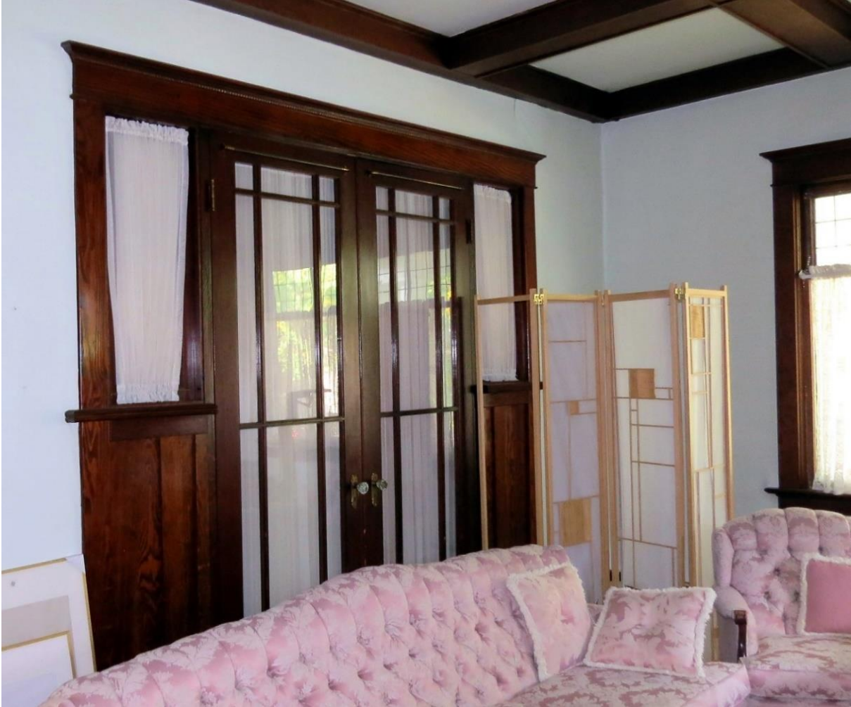
(Image 3.5: Multi-light French doors with sidelights and original hardware)