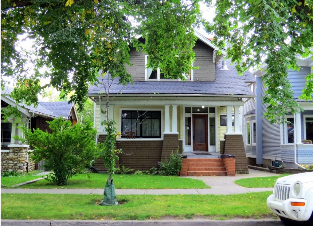
(Image 2.1: North (front) façade showing front cross-gable dormer and full-width front veranda)