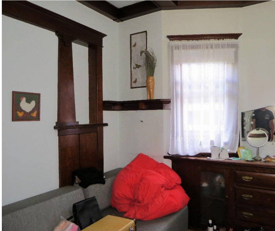
(Image 3.7: Room separator (left) with built-in drawer and cabinet unit (right))