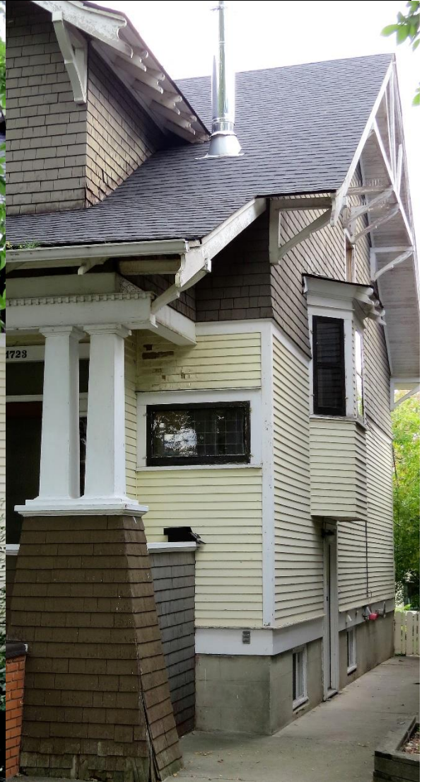
Image 2.6: Shed-roofed bay window with exposed rafter tails on west façade, projecting verges in side gable with stick work in the gable peak, wood belt course, water table with drip mould and corner boards