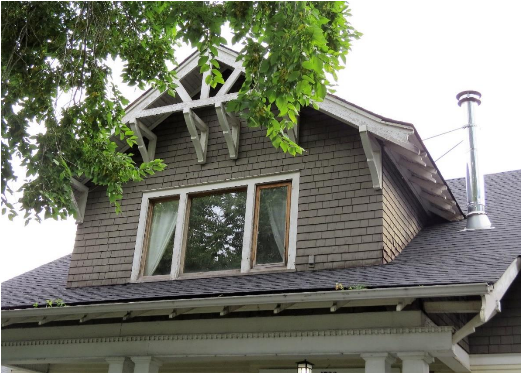
(Image 2.2: Detail of front cross-gable dormer on high-pitched, side gable roof; stick work (gable peak); overhanging eaves with exposed rafter tails, wood brackets, wood tongue-and-groove soffits and moulded frieze; projecting verges with vergeboards with decorative ends)