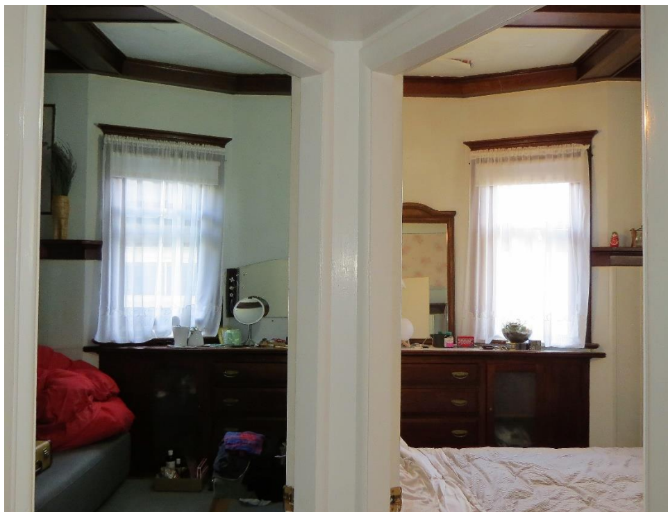
(Image 3.8: Built-in drawers and cabinet (partitioning wall constructed over built-in drawer and cabinet unit during previous renovation))