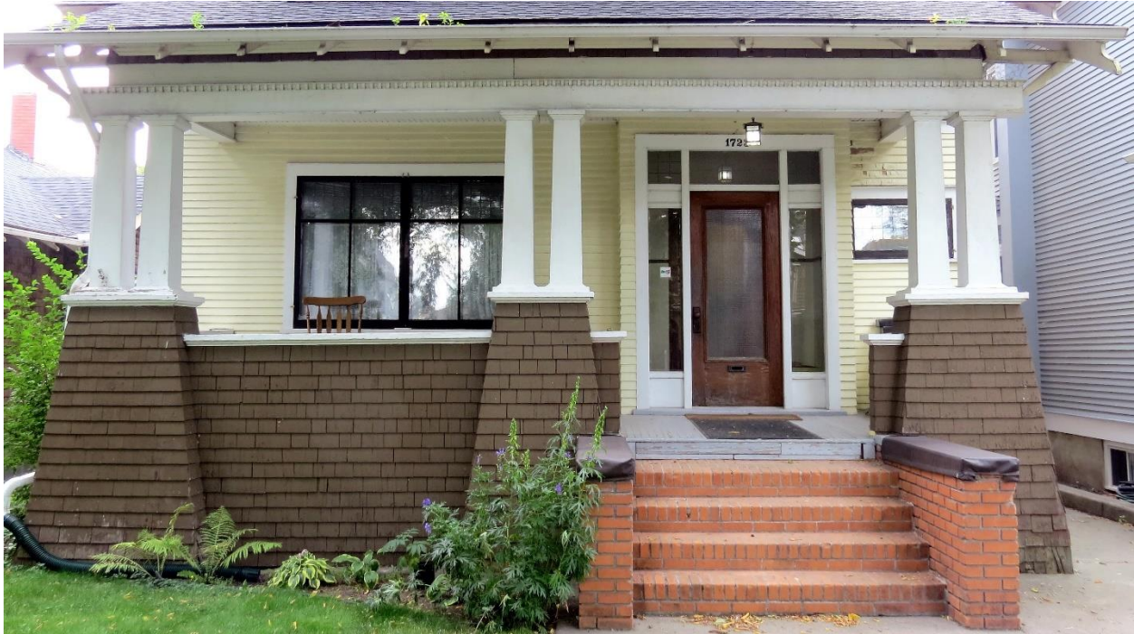
(Image 2.3: Detail of full-width shingle clad, front veranda with closed balustrade, tapered piers and twinned, tapered posts supporting moulded entablatures)