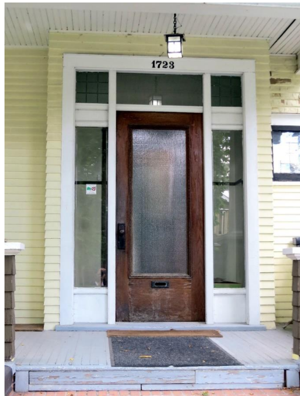
(Image 2.4: Detail of offset front entry on front veranda with side-lights, 3-light transom, wood surround, and original wood door with glazed panel and wood tongue-and-groove ceiling)