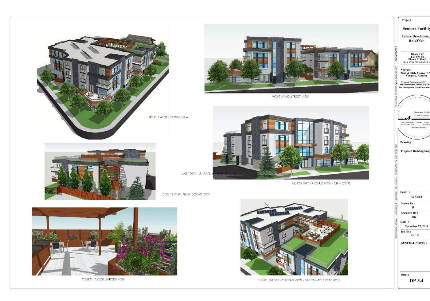
Figure 1 Proposed Development

The following excerpts (Figure 1 & 2) from the development permit submission provide an overview of the proposal and are included for information purposes only.