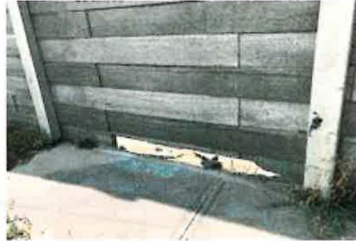
24 St SW & Richmond Rd SW