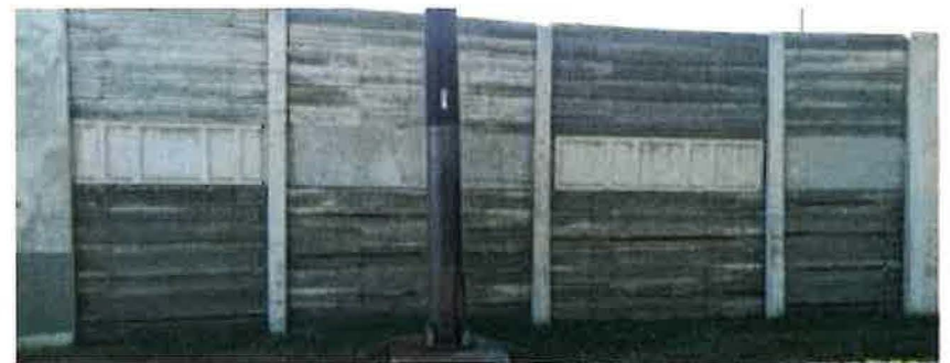
7a St NE