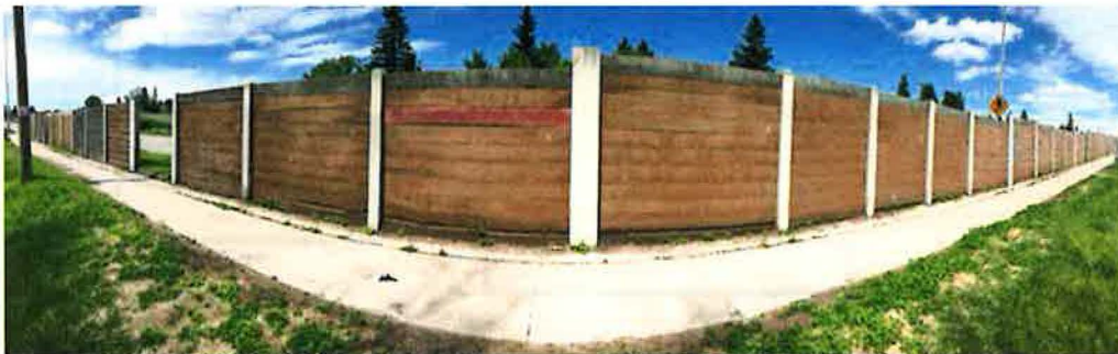
Southland Dr SW, adjacent to Sydney Dr SW