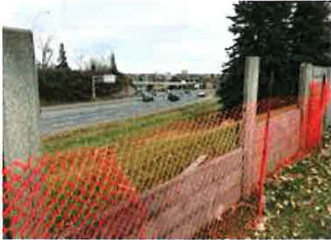
22 - 22a St SW - off leash park