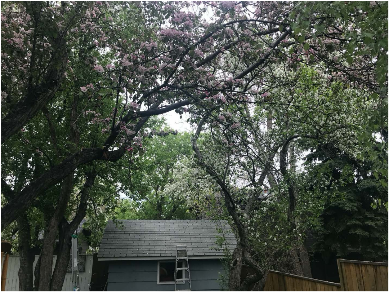
Our backyard in Spring. You can see why we love spending time out here.

If we no longer have a sound wall and only have a chain link fence, then how can that SWBRT promise be fulfilled to citizens? And how is this fair to residents, or community associations that supported the project because of this assurance?