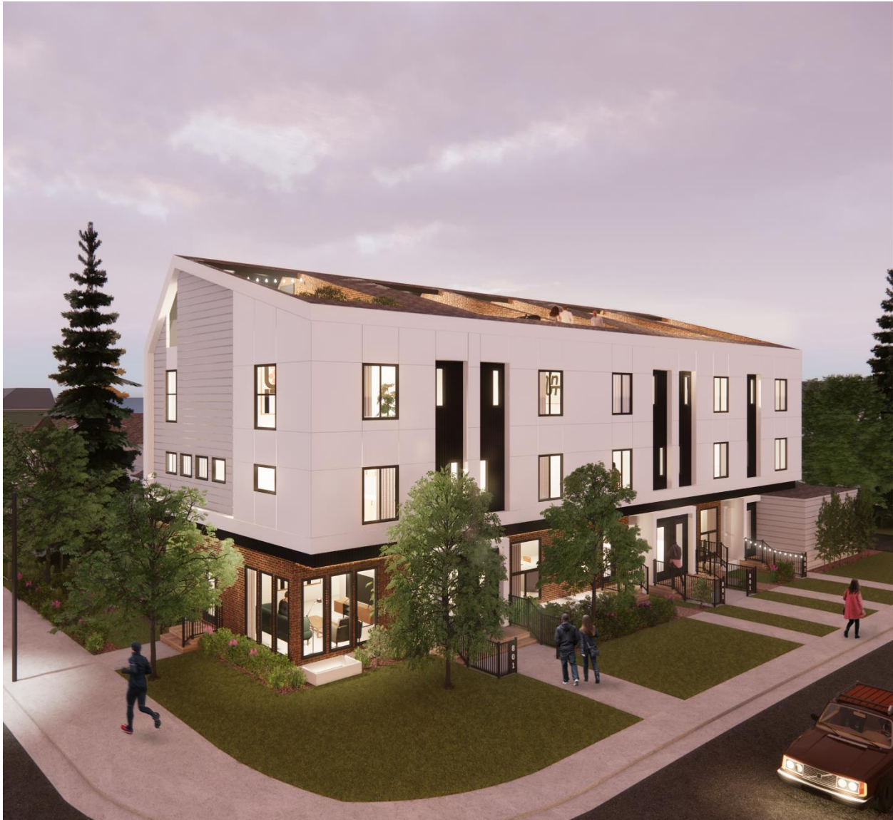
Figure 1: Rendering of proposed development (view from corner of 8 Avenue and 7 Street NE)

The first detailed team review for the development permit was issued on 2020 October 06. Administration is still working with the development permit applicant to address the technical review and design comments.