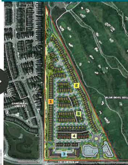
Revised Concept Presented at Open House #2