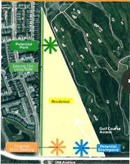
Open House #1 - Sharing the Initial Vision