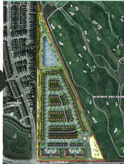
Information Session #3: Refining the Plan