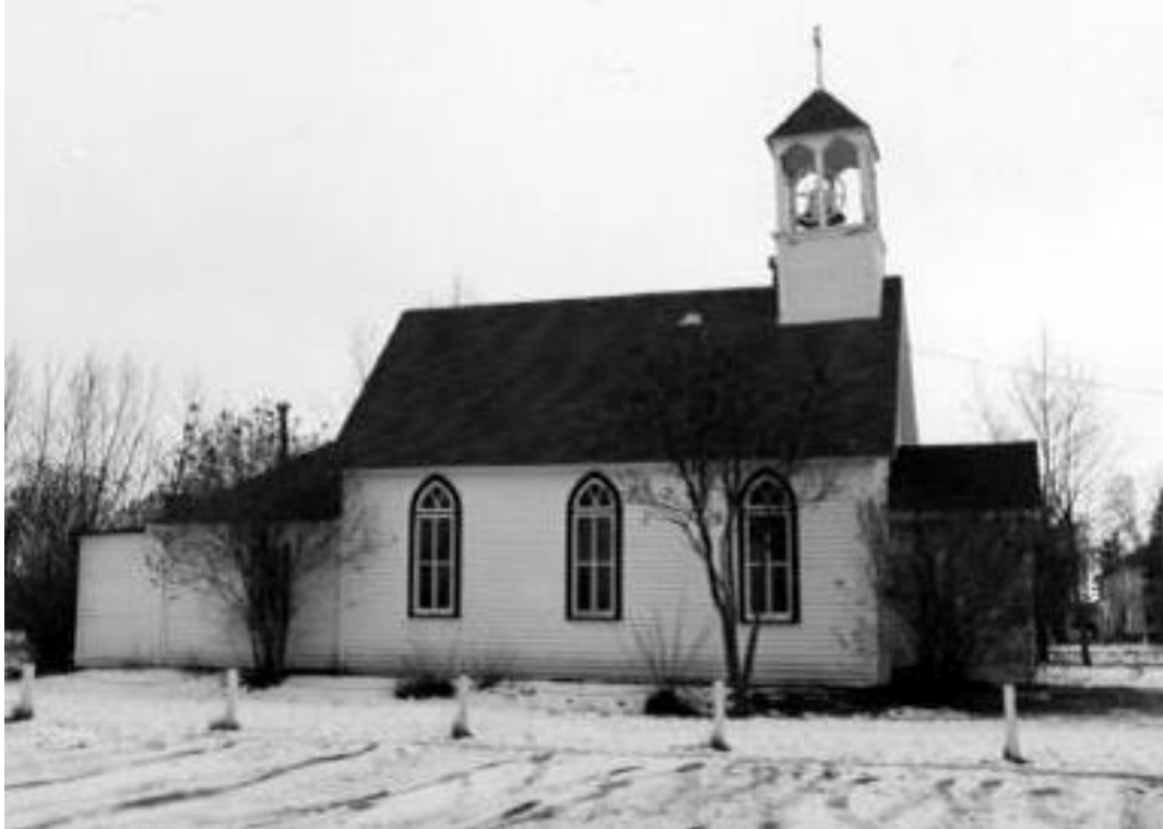
(Image 2.2: ca.1970 photo showing original extension and bell tower)