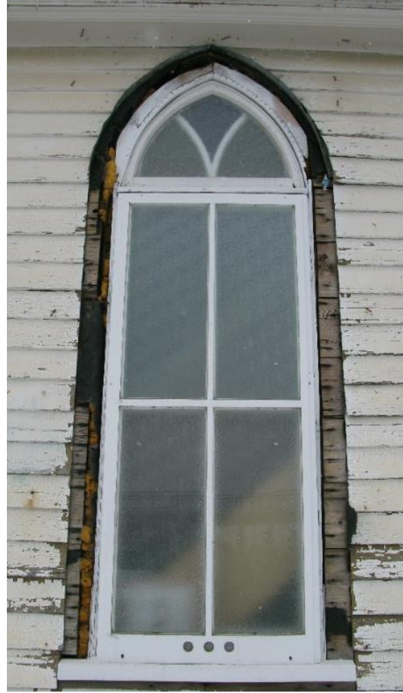
(Images 2.8 and 2.9: Examples of typical 2-over-2 double-hung wooden-sash window with 3-light fixed stained glass, gothic-arched transoms and wooden lug sills; 4-light wooden storm window. Note: finishing wooden trim uninstalled)