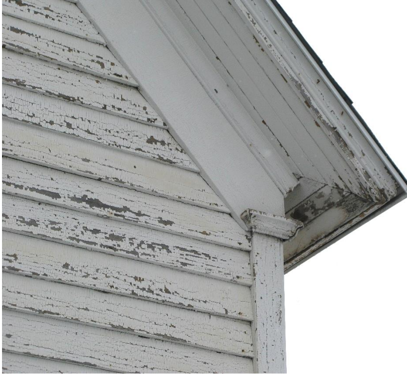
(Image 2.6: detail of bevelled-wood siding and wooden corner board topped with decorative trim; overhanging verges; overhanging eaves; wooden tongue-and-groove soffits, moulded wooden fascia and moulded wooden frieze)