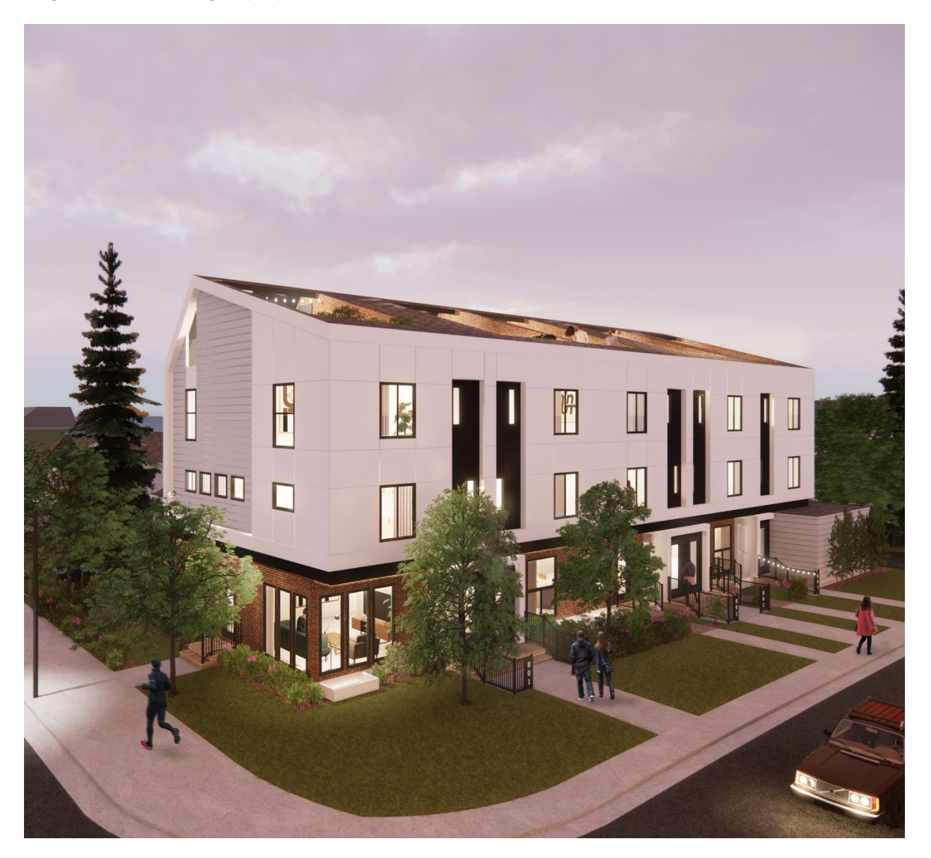
Figure 1: Rendering of proposed development (view from corner of 8 Avenue and 7 Street NE)

The first detailed team review for the development permit was issued on 2020 October 06. Administration is still working with the development permit applicant to address the technical review and design comments.