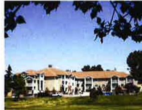
Affordable & Accessible Lifestyles