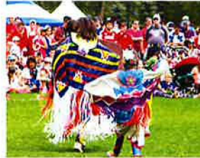
Arts & Culture Opportunities