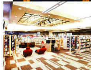
Public Services & Facilities