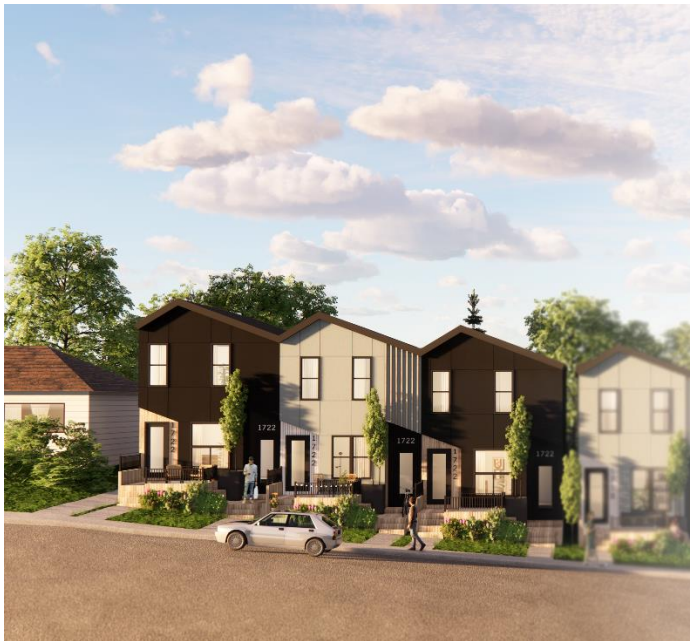
Figure 1: Rendering of the Proposed Development

Administration's review of the development permit will determine the ultimate building design and site layout details such as parking, landscaping, site access and amenity space. No decision will be made on the development permit application until Council has made a decision on this land use redesignation.