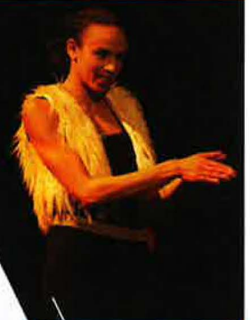
He'll see performs at We Gon Be Alright