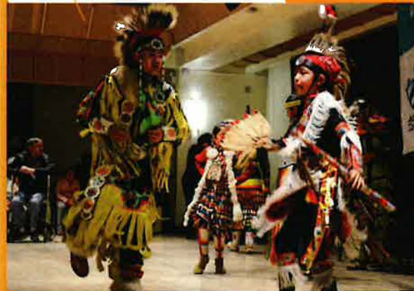
Dancers perform during National Indigenous Peoples Day