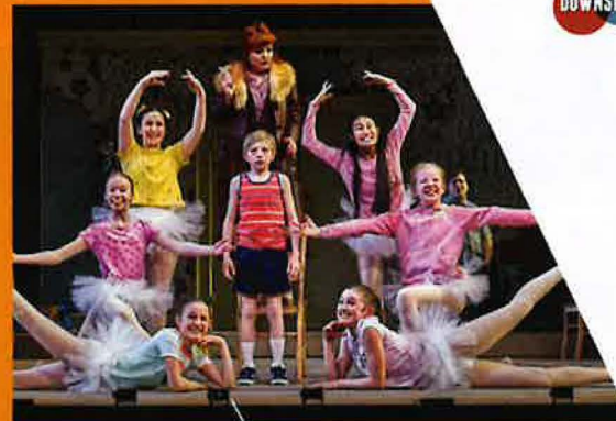
Theatre Calgary's Billy Elliot The Musical