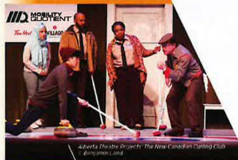
Alberta Theatre Projects: The New Canadian Curling Club © Benjamin Laird