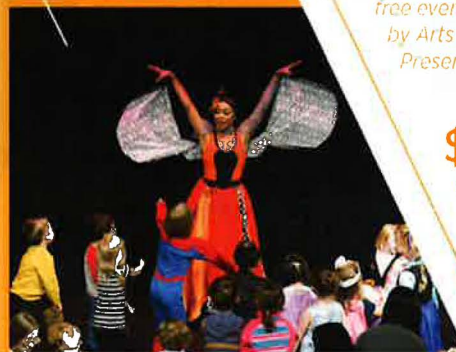
Performers at the Itty Bitty Arts Day

people attended a free event put on by Arts Commons Presents