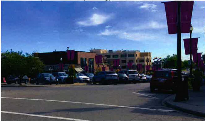
49 Avenue (commercial parking)