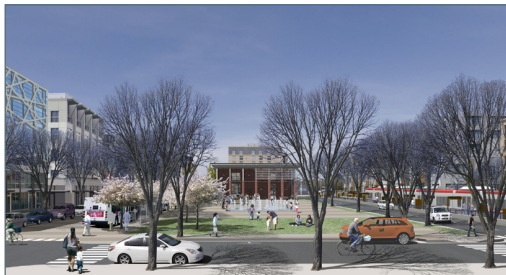
64 Avenue N initial state (above) and long term vision (below)