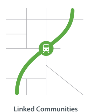
Layer 1 Build LRT and stations