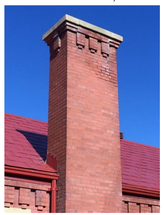
(Image 2.4: Detail of corbelled modillions and sandstone cap of red-brick chimney on east façade of rear addition)