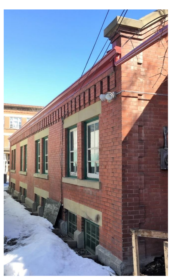
(Image 4.2: Oblique view west façade rear addition looking northeast)