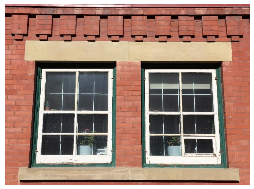
(Image 2.2: Typical fenestration and corbelled modillions on side elevations)