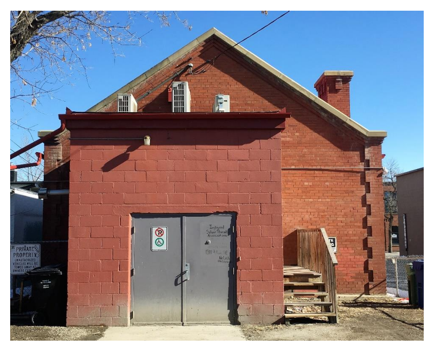
(Image 3.1: South façade with ca. 1955 cinder block rear extension)

Note: the single story extension built ca.1955, is not regulated and a return to original configuration/appearance would not be precluded where documentation of original configuration exists.