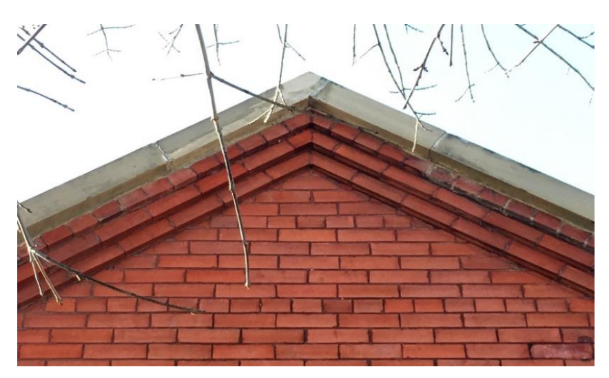
(Image 1.3: Detail of common bond pattern red brick with red-pigmented mortar and corbelled cornice at gable edge with sandstone cap)