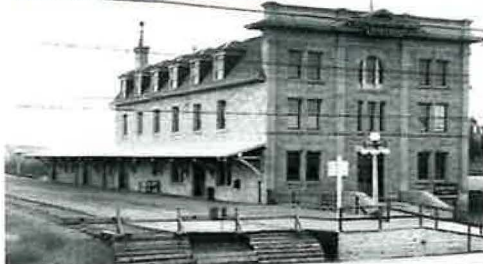
Glenbow Archives ND-8-308

Heritage Status - Added to The City's Heritage Inventory in 1982