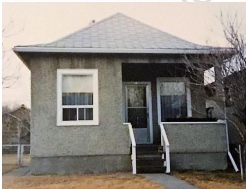
(Image 2.2: Historic image of south façade, circa 1969-72)