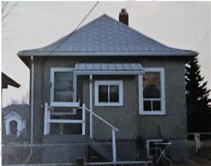
(Image 2.4: Historic image of north façade, circa 1969-72, Copyright Eileen Simpkins)