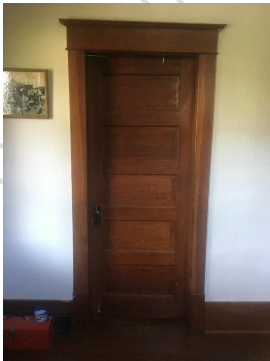
(Image 3.2: Example of typical 5 panel door and door casing in the hallway)