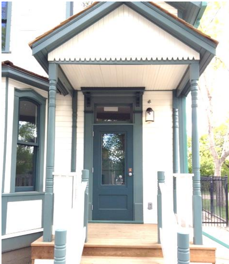
(Image 1.3: Porch and front door surround with decorative crown over single-paned transom)