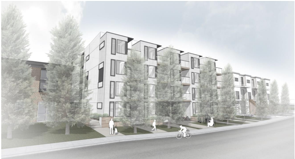
Figure 1: Rendering of Proposed Development (southwest view from 15A ST SW)

The review of development by Administration will determine the ultimate building design, number of units and site layout such as parking, landscaping and site access. No decision will be made on this development permit application until Council has made a decision on this land use designation.