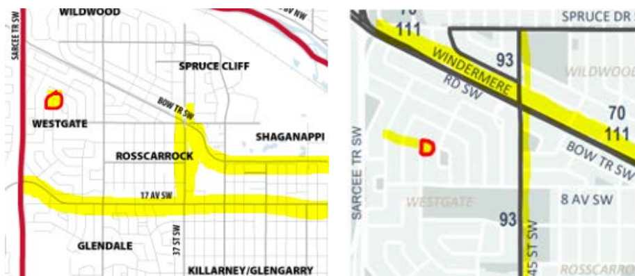
Image 5: The first map shows Westbrook Communities (red outline) with key areas for future growth such as Main Streets and Transit Corridors highlighted in yellow. The second map shows existing bus routes and pass-through walkway highlighted in yellow. On both maps the Property is highlighted in yellow and circled in red.

Some of the neighbourhoods near Westgate, such as Rosscarrock and Killarney, and to a lesser extent Spruce Cliff, Shaganappi, and Glendale, have seen considerable R-C2 redevelopments over the past 10 years and it continues to happen today. As seen in Image 5 , the neighbourhoods where R-C2 rezoning is prevalent are all adjacent to the key growth areas. This type of redevelopments make sense in these neighbourhoods because they are much close to the key growth areas and advance the overall planning for Westbrook. Conversely, the Property could hardly be farther from any of the key growth areas, transit corridors and the nearest bus routes on Bow Trail and 45 th Avenue.