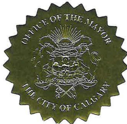
NAHEED K. NENSHI MAYOR