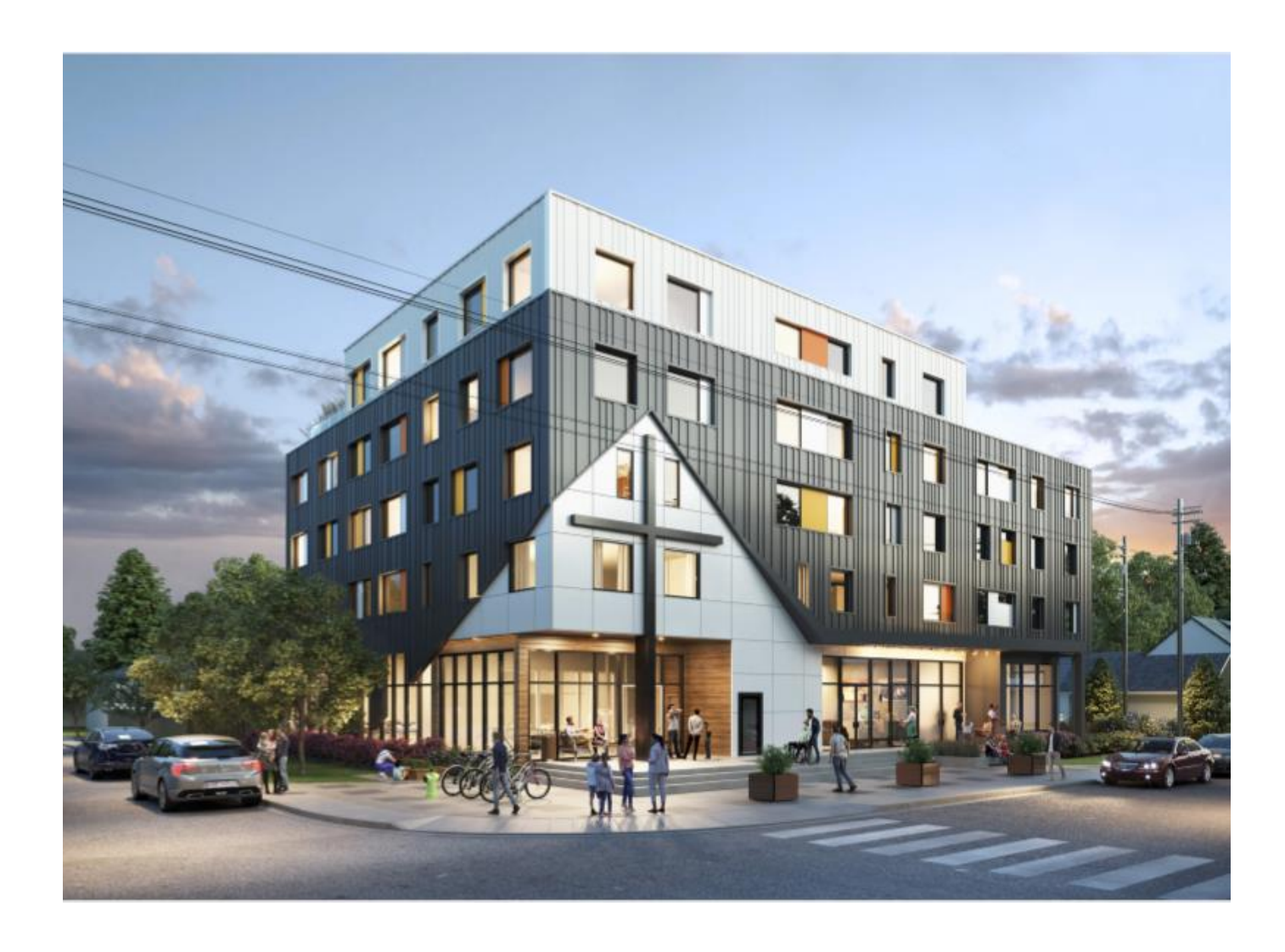
Figure 1: Rendering of Proposed Development (View from corner of 74 Avenue SE & 23 Street SE)

Administration's has completed a review of the development permit has determined that it is acceptable, however, no decision will be made on the application until council has made a decision on this land use redesignation.