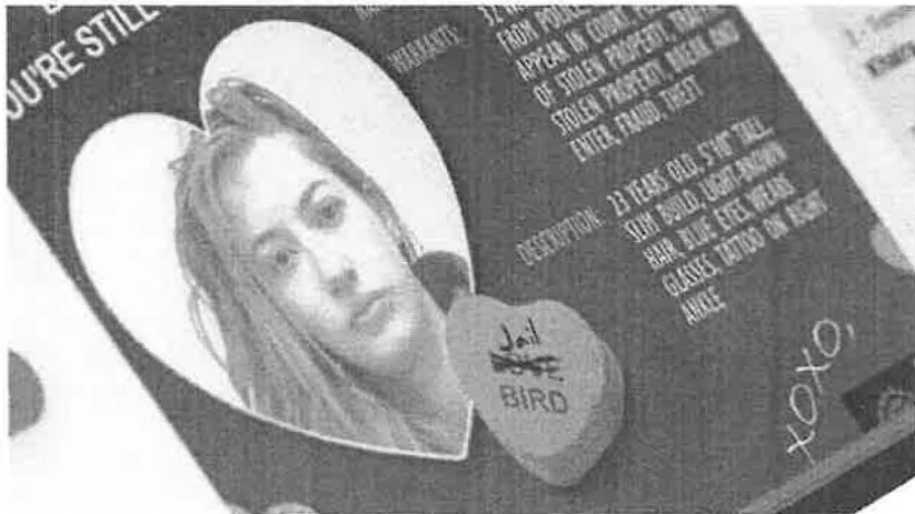
Calgary police removed a social media campaign which featured suspects wanted on warrants in punny Valentine's Day cards. "We're not fooled by the rocks that you got, you're still Jenny from the (cell) block," this card reads, referencing a Jennifer Lopez song.