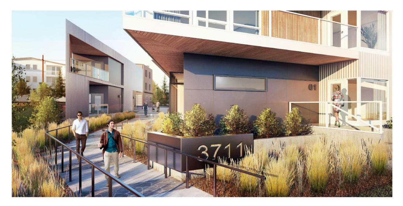
Figure 1: Rendering of Proposed Development (southwest view from 15 ST SW)

The review of development by Adminstration will determine the ultimate building design, number of units and site layout such as parking, landscaping and site access. No decision will be made on this development permit application until Council has made a decision on this land use designation.