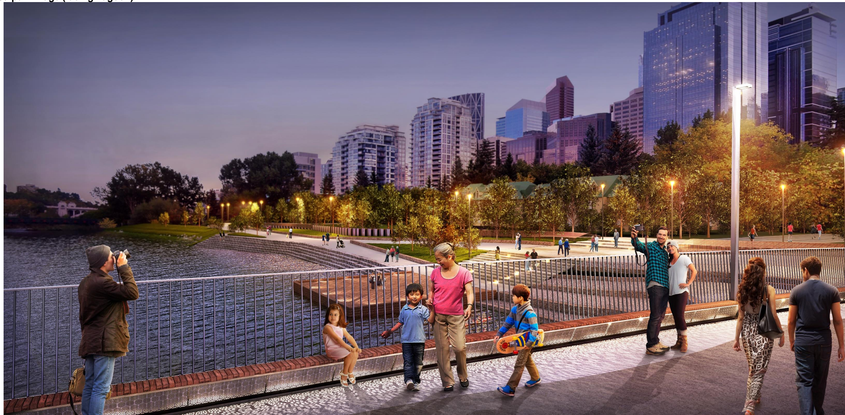
Jaipur Bridge (facing Lagoon)