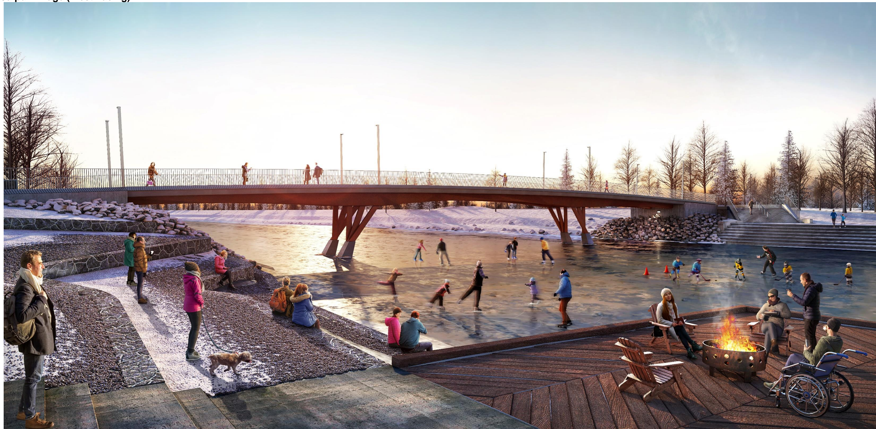
Jaipur Bridge (West Facing)